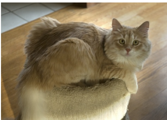
Blitzen being cute, as usual.