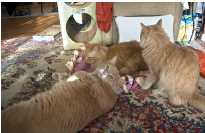
Blitzen and Nicky try to cheer Bob up.

Even though Bob was tested years ago, this is the time to make SURE he is FIV+ because that will effect his ability to get a surgeon to take on his case. Because he was not neutered at an appropriate age, he got FIV. This is my Mother's fault and I will never forgive her for not caring for her cat. His life would have been so much better if he'd been neutered sooner and not left outdoors to get into fights with other territorial males.