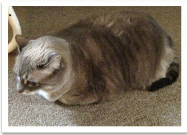
Chole's back fur is quite matted and I'm sure causing her some discomfort.