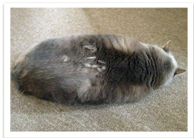
Oh dear, dear, Chloe.

A few days later, Chloe was taken to the Vet. I don't know how they managed, but they did get blood work done and there was nothing indicating her thyroid was off, which could have caused her emotional issues, or that she was diabetic, which was surprising. I don't know if the Vet looked at her teeth, but Chloe probably had some painful gums, at least, from all the junky food.