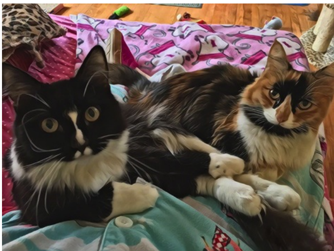
Never far from each other Andy with sister, Annie.

Thankfully, I was with one of our dear friends, who also is an amazing artist and volunteer for our rescue. She heard the same things I did about the woman putting her cats down after either not providing care for them, even though she knew they were sick ( because apparently in her mind that's what you do, just let them decline and die in pain ) OR she spent a lot of money only to give up on the cat when the cat needed further care for a few weeks to a few months. She acted as if she was a Saint, when she was heartless and cold. I thought perhaps I was misjudging her, weighing too heavily that she was also 74 years old and I wasn't sure any of her adult children (one had 6 kids of his own and is a busy physician) would even step in should something happen to her.