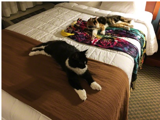
Chillin' in the hotel, but sadly no room service.

Last Friday I was to drive Annie and Andy to Fairhaven, MA, to attend a cat show where they would be our Kitten Associates representatives. For fun I was going to have them judged, too, in the Household Pets Division. The night before we left I thought Annie was a bit flat, but by morning she was perky and eating like a champ. I decided I was being too protective and thought she'd be healthy enough for the trip.