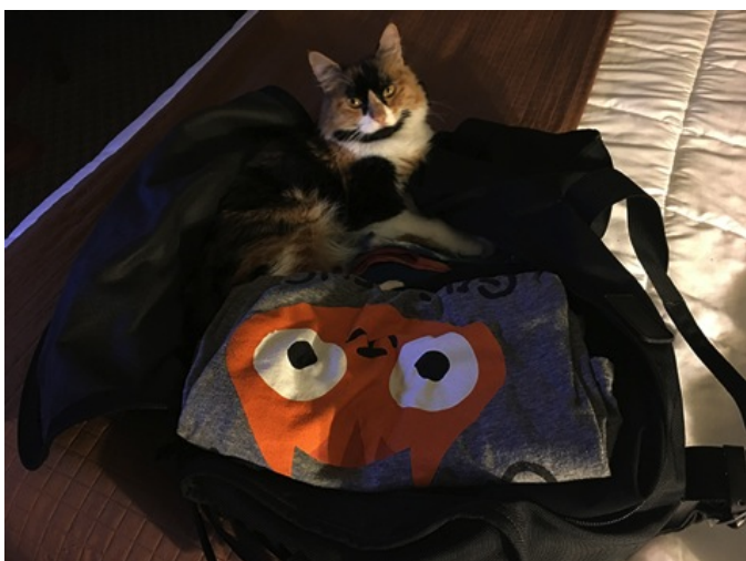
Ready to go home. Annie jumps into my suitcase as I pack the last night of the cat show.

We returned to the vet this morning and after the year I've had, I was not happy to be there. I was scared. I was scared for Annie, that it was going to be really bad news. Our cat Nicky just died a few weeks ago and the health scares with our new foster cats Belle and Buddy did a number on me. Here we are at the cusp of the Holiday season and I am terribly behind in my work and holiday planning. I have too much on my plate, but nothing is more important than the well-being of our cats.