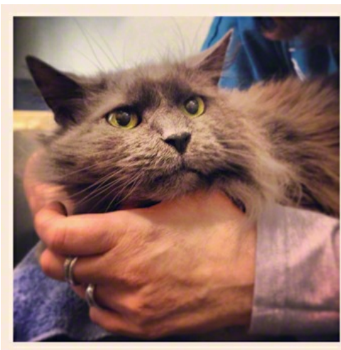
Gracie at one of her MANY vet visits.

Pandora Syndrome can be a combination of many factors—genetics, environment, stress and diet. The result can be IBD, dermatitis, cystitis and more. Once I read this article, I realized that because this might have genetic aspect we may never be able to “cure” Petunia entirely. Then the light bulb moment: Petunia's mother Gracie must ALSO have it! It would answer the question as to why we have never found a treatment for Gracie's mysterious miliary dermatitis.