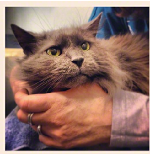
Gracie at one of her MANY vet visits.

Pandora Syndrome can be a combination of many factors—genetics, environment, stress and diet. The result can be IBD, dermatitis, cystitis and more. Once I read this article, I realized that because this might have genetic aspect we may never be able to “cure” Petunia entirely. Then the light bulb moment: Petunia's mother Gracie must ALSO have it! It would answer the question as to why we have never found a treatment for Gracie's mysterious miliary dermatitis.