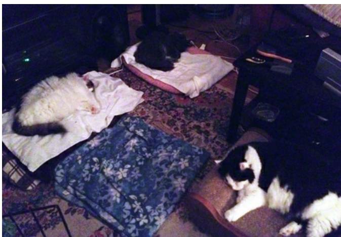
Gracie, surrounded by Spencer and DOOD.

Last night after giving her some dinner I gave Gracie a kiss and told her to hang on. She was still Gracie, still chirping, purring away, maybe getting up a few too many times to lap at water, but she was still there. I went to bed with a heavy heart. I knew that in the morning I'd have to face the music. Either we do this or we give up. Wednesday is the day of her appointment.