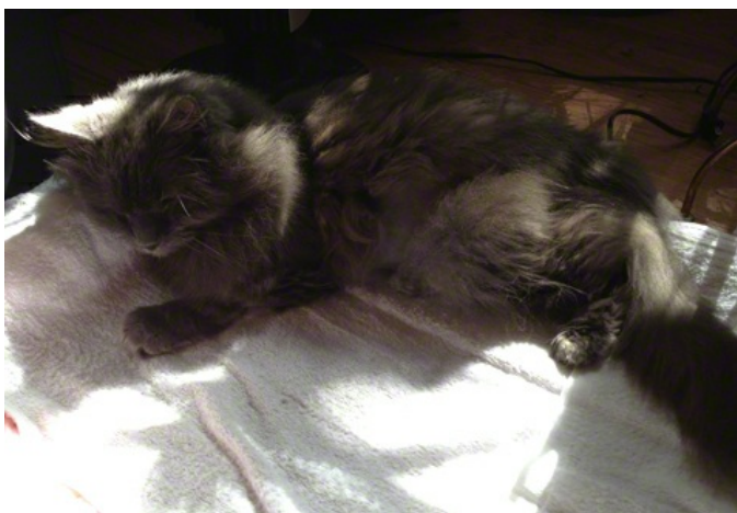
Resting in the sunshine.

Morning chores take forever so I got started: warm up cat food, scoop litter pans, clean up Gracie's area, then put out freshly washed bowls with fresh water, add new litter if pans need them, clean up any "surprises" from the night before, go out to the garage to feed Barry and scoop his litter pan, then prepare some food for Gracie and pray she eats it ( and that's only for OUR cats, then I do it all over again for the remaining foster cats, too ).