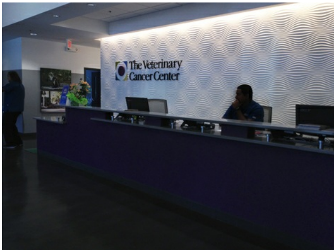
Interior of VCC.