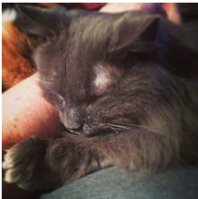
My darling, Gracie.

The knot in my gut is gone, but I admit I'm on episode 87 of Frasier to keep myself calm. I started working again and getting my life back on track. Though we've had some downs, Gracie has mostly been on the up and up. She still sleeps in one small area of the living room on the big oriental rug, but she's getting on her feet more and more, even meeting me at the door one day, meowing at me to be fed.