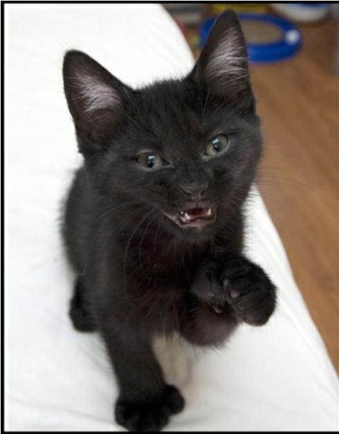
Dahlia wants money to buy a catnip tea. She's such a gold digger!

The good news is that I'm up for TWO BlogPaws Nose-to-Nose Awards and the event will be streamed live a week from Saturday! I don't know if you have to be a paid registrant to view the festivities, but once I find out I'll let you all know since it was all of YOU who got me the nominations for Best Meow Blog and Best Blog Writing!