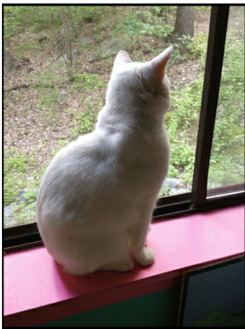
Jackson enjoying the view of the woods.

And finally, King. King is doing well . We ordered his Leggings for Life to cover his back legs. King's back legs end an inch short and he has no back paws. We want to cover his back legs so the ends of the legs, which end in a callus, don't get scraped or bruised. Personally, I hope these things come in cool colors!