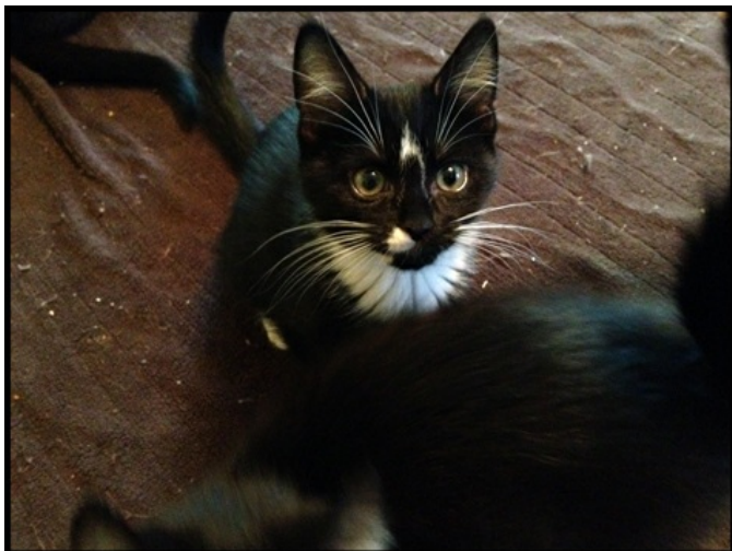
Sabrina this morning before I took her to her spay appointment.

After having to re-schedule three times over the past month, this morning I dragged my weary butt out of bed and took the Kittens in Black to visit the Vet. Sabrina and Black Beauty are getting spayed ( as I write this ) and the others are getting their Distemper Combo booster vaccination. Normally, I'd be assisting on the spay surgeries, but I admit to feeling grateful they didn't need me today. I've had the kittens since they were a week old. The idea of doing things to them that I know will make them uncomfortable and cause them pain is very difficult to accept. These procedures must be done, but can't I sit in the other room and not watch this time?