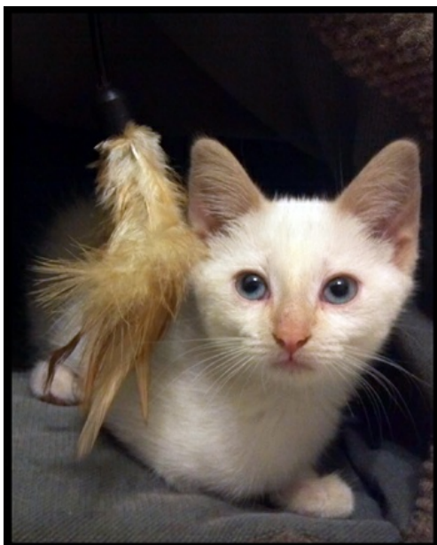
Our little (and first!) flame point, Coco.

Jackson Galaxy-the cat continues to yowl late at night or early in the morning, but each day it's less and less. He's attacked most of my cats at least once. I rarely ever see things heat up so I don't know who started it or why it's happening. My cats give him a lot of space, but I also see them sitting a foot away from him looking out the same window or sleeping not far apart. I see Jackson wanting to play, but some toys scare him. He loves to chase after a stuffed carrot cat toy or the laser pointer, but he doesn't like feathers or strings waved in his face.