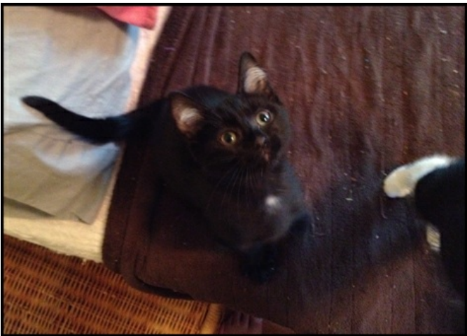
Cutie Patootie wants to know where breakfast is and why it's late (answer, you're going to the Vet, don't back talk your foster mom!).

I'm trying to sort through applications and find good adopters. I really need an assistant. Between making calls to the adopters, the vets, doing a background check, then trying to co-ordinate home visits and having the adopters come here, get cats to the Vet and put them on Petfinder, leaves me little time for anything else. I've been trying to get volunteers, but I'm starting to wonder if I don't have a good gene for volunteer-finding. It's been over a year and I have one person I can count on to help with adoption events. I need to find time to get some volunteers..sort of ironic, now that I think about it.