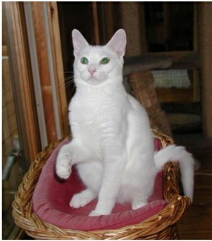
Purrl.

She sits quietly on her favorite lap or snuggles under the covers.