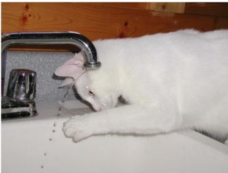
Purrl with water.