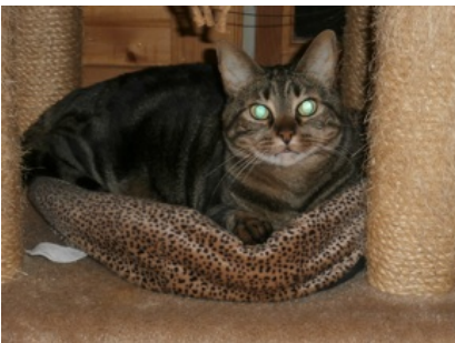
Arby.

I am a happy little guy who gives great head-butts and leg-huggers and will flop on my side for tummy rubs. Plus, I've been called a gorgeous hunk with my silky bullseye silver/black tabby pattern and have been mistaken as a Bengal (shhh, I didn't correct them)! I am the 'managerial' type and like to supervise all the house happenings, like vacuum cleaning, bird watching, and will help with supper to sample and make sure all is fit for eating! If you forget to give me samples, I will remind you with leg-taps, and then will loudly let you know if you ignore me. I always make sure you know when feeding time is as I like to keep a strict household routine. I love to play and chase my brother, Checkers, or other kitty friends to make sure they are getting their exercise. I am a young adult at only 5 years old so have many managing years ahead of me. I'm looking for my furever home where I can help with the household duties and will never have to be living on the street again. I do startle easily so would like a quieter home without young children. I only need a patient person who understands my traumatic start in life to give me time to adjust. After I adjust, I will become your best buddy!