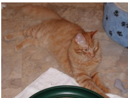
Checkers.

Let me tell you a little about my great qualities, as there are many, if I must say so myself. I am as cute as a button with all the wonderful Maine Coon qualities - ear and toe tufts, leather-colored nose, bushy tail with long britches, big size, great head-butts and a 'Redhead' as my foster mom calls me, and my gold eyes match my silky long coat. I am a great bug-catcher and can spot a bug a mile away and catch it, just so you know what I am doing under that carpet! And, you better not leave feather toys out as I will catch and tear them apart, feather by feather. I love watching TV - especially dog agility as I think it's funny seeing those dogs following everything a human tells them to do - how funny is that?? My motor is loud if you give me some pets, especially along with some tasty chicken! I am still a young adult of 5 years. I would like to be with my brother Arby or would make a good companion for another kitty. I am listed as 'special' because I will need a quiet home and patient person to give me adjustment time after my traumatic start in life. Once I've adjusted, I will bond very closely with 'my' person and would love a lap to myself.