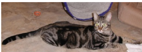
Lovely swirls on Arby.