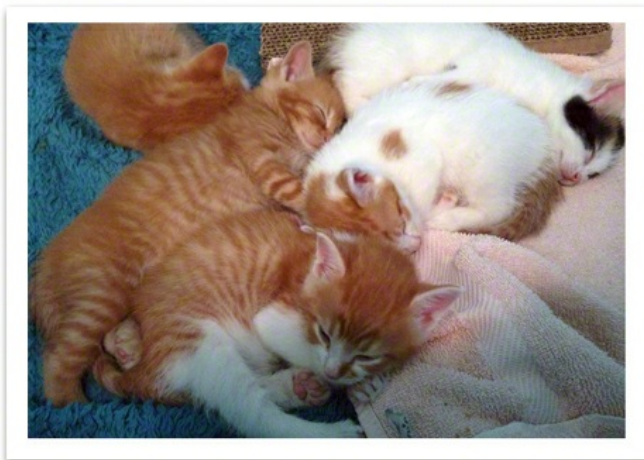
Passed out pile of cuteness.

As the kittens reached 4 weeks of age, the "drunk walk" they did began to become more confident strides. I was glad to see those days pass. Although endearing to see, it also reminded me of Fred's last days of not being able to walk at all. Seeing the kittens sure-steps gave me some relief, too. It meant their muscles and bones were growing stronger and more capable. With each day, another small miracle. Their weight continued to increase as their awareness of the world expanded.