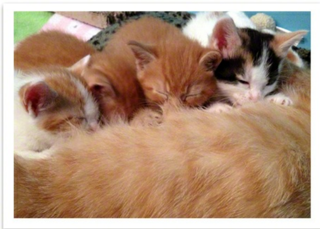
Minnie's milk bar is still open for lunch.

But before that happened, let's take a look back on the last days of the Blue Bathtub.