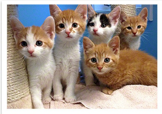
The gang at 7 weeks: Confetti Joe, Yukon Stan, Lil' Gracey, Precious Pete & Jellybean Mel (front).

The miserable heat wave has vanished, replaced with blessedly cool and drier air. The windows are open for the first time in weeks. It feels more like autumn than the middle of July. I'm grateful for the respite, even if it will just last until morning.