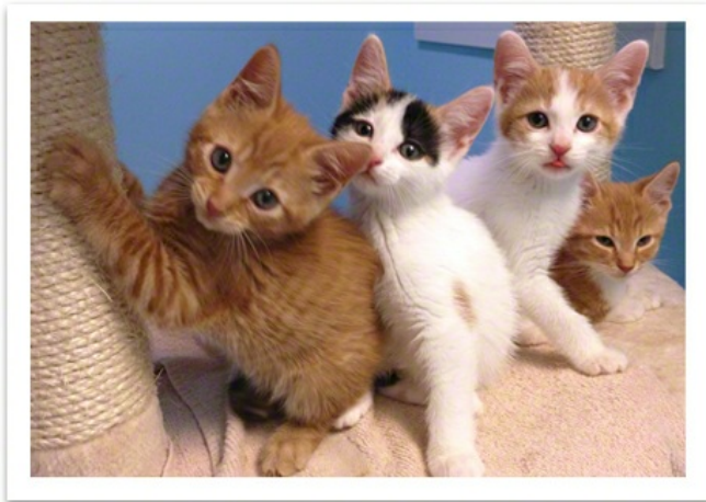
My little rock stars.

On the second day, I saw less blood, but in a somewhat formed stool. The kittens behinds looked cleaner and the litter pan wasn't as loaded. I went back to a new de-wormer and started them on that to see if it would help. I knew I might have to use something more powerful if I couldn't get the blood to stop, but for now the kittens were racing around, gaining weight and having fun. No need to flip out.