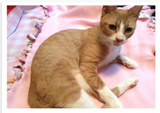
Minnie between vet visits.

Minnie's kittens continue to delight me. Even without their mother's careful tutelage, they surprise me by being willing to accept me as their surrogate—at least in as many ways as are appropriate. For a little over two weeks the kittens have been mine alone. Minnie has completely turned over her duties to me, without a look back or regret. She moved on before any of us were ready. Her sudden apparent rejection of all her kittens, first brought on by the pain of her illness, then perhaps due to her hormones, urging her to procreate again, was rather shocking. It was as if a switch was flipped and with it her motherhood came to a premature end. The kittens and I were lost for those first few days. Neither of us wanted to give up on her so each day I offered her one kitten. I held the kitten out to her with the door opened to her room. At first she would act out violently, hissing and growling, scaring the poor kitten badly. I'd soothe its fears and put it back with the others. Minnie would go back to her place and lay down, grooming away her anxiety over being presented with an unwelcome guest.