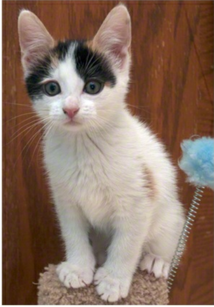
Gracey.

What I didn't expect was how the kittens immediately rallied, focusing their interest on me. When I'd previously entered the room, they would look up, maybe run past me, but now, they run over to me, try to climb up my leg or cry at my feet, hoping to be lifted into my arms for a cuddle. For seven and half week old kittens, they are all very friendly and affectionate. I realize that this will be better for them in the long run. Bonding with a human will serve them well one day when their families come to find them.