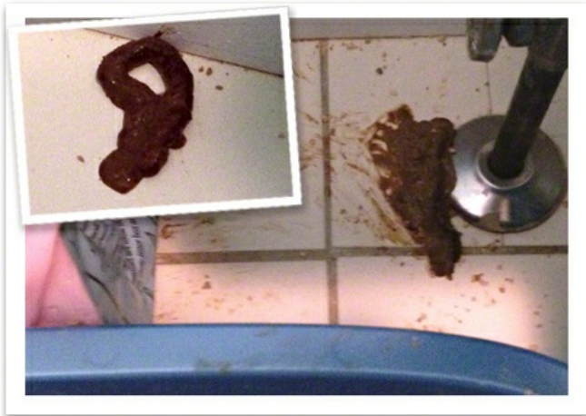
After a day of raw (inset), canned food moosh-poop.

It got to the point where I didn't want to enter the foster room. The poo-piles were always somewhere tough to get at, like behind the toilet and the smell could be bottled and used as a chemical weapon. I was very worried when I saw blood, some of it mucousy, in their stool. The kittens had very wet bottoms and many cried while in the pan. It's one thing to work with one sick cat, but five sick kittens is a test of how to stay calm when in your mind you imagine that the kittens have the beginnings of something terrible and not just simple loose stools.