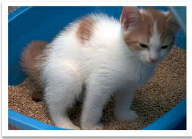
Poor Joey. Straining and crying in the litter pan.

On the second day, I saw less blood, but in a somewhat formed stool. The kittens behinds looked cleaner and the litter pan wasn't as loaded. I went back to a new de-wormer and started them on that to see if it would help. I knew I might have to use something more powerful if I couldn't get the blood to stop, but for now the kittens were racing around, gaining weight and having fun. No need to flip out.