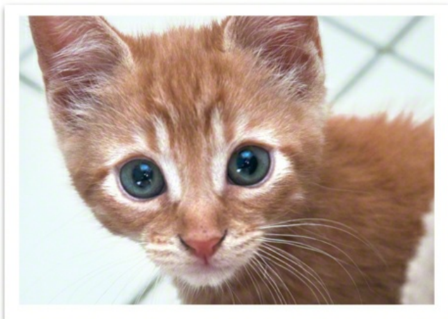
Mellie.

We opted to give Minnie her Rabies and FRVCP (distemper combo) vaccinations. I thought she'd be fine, but she had a nasty reaction to the shots. Her right front leg went lame and she didn't get up for the next 24 hours. Worried, I called two Vets and they said to give her another day. By the second day she was up on her paws, but not eating well. I sat down next to her to give her some reassuring pets when I noticed a big red lesion under her left front leg- nowhere near where her vaccine was given.