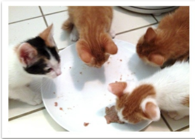
Eating raw.

What I didn't expect was how the kittens immediately rallied, focusing their interest on me. When I'd previously entered the room, they would look up, maybe run past me, but now, they run over to me, try to climb up my leg or cry at my feet, hoping to be lifted into my arms for a cuddle. For seven and half week old kittens, they are all very friendly and affectionate. I realize that this will be better for them in the long run. Bonding with a human will serve them well one day when their families come to find them.