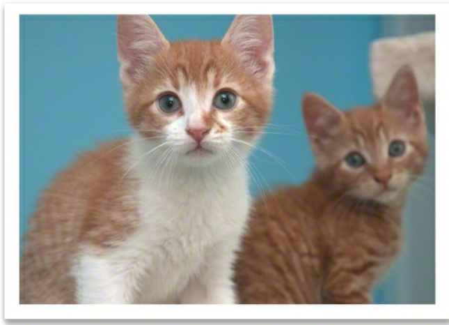
Stan and Mel.