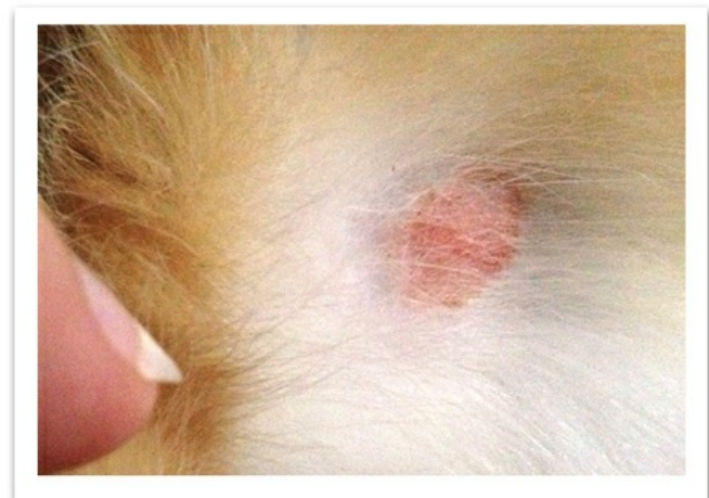
A foreign lesion.

a look. He thought it was an Eosinophilic plaque [1]-possibly brought on by the vaccine OR it was "RW."