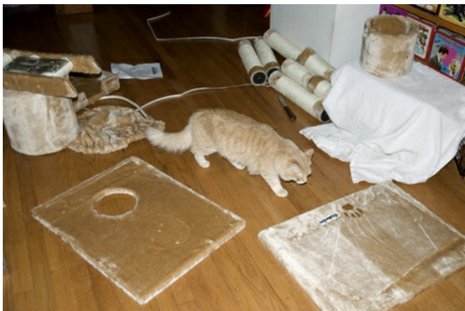
Blitzen, the parts inspector arrives.