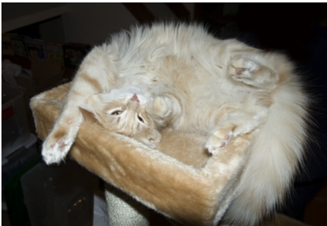
Blitzen gives this cat tree a 1-Belly Up!

Of course, tell that to Blitzen. He loved it. There was only one problem.