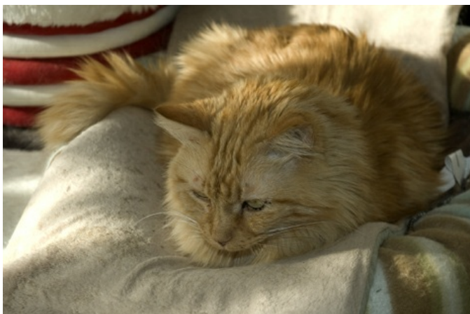
Bob, enjoying his heated cat bed.

Bob was like Blitzen once-a long time ago. I never knew Bob in his youth, only as an adult. I bet he was a handful when he was a baby. I find myself wishing that I COULD have been his “mama,” from day one. I could have prevented him from getting FIV+, he'd still have all his teeth and most likely, he never would have gotten a mass on his liver in the first place...but I can't get a “do over” to put Bob back together again. I don't have the right tools and I'm pretty sure the instructions are written in Chinese.