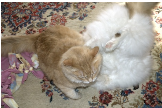
Not sure which end of Spencer you're seeing in this photo.

I admit that Blitz is good for cheering me up when I'm feeling down, but it makes me feel guilty, too. Blitz is, in some ways, much like Bob. Blitz has a crazy purr and it's obvious he shares a resemblance with Bob, though Blitz is very light in coloring. Blitz is all things joyous and fun-full of promise and magic. He has decades ahead of him, most likely. His story is just beginning.