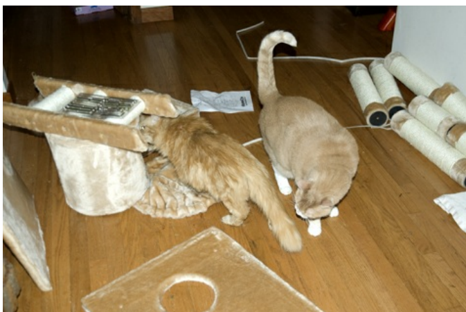
Bob helps with the inspection, but as usual, Nicky fails by smelling Bob's tail, instead of the parts of the cat tree.

Blitzen was fascinated. He sniffed and climbed on everything. Bob and Nicky joined in, but were soon bored and went back to taking a nap. Blitzen, began to scratch on the sisal posts just seconds after they were in place. Lock down a sleeping platform and he was on it having a field day.