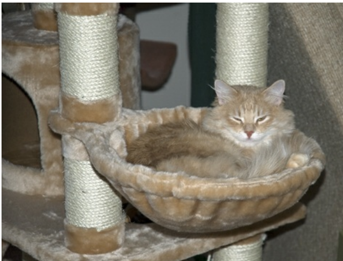
Bucket o' Blitz.