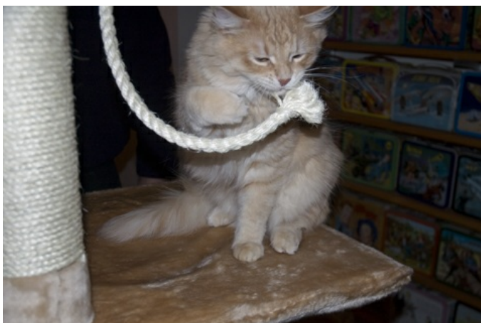
Bratty boy "helps." (we're still building the cat tree at this point)

Blitz was certainly test-driving the cat tree and it was a good thing he did-he's about the ONLY cat that will actually FIT onto or into most of the damn thing!