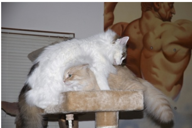
Spencer was investigating the top of the cat tree when Blitz reminding him whose cat tree it was.