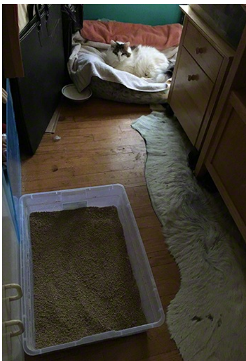
The setup in my office for Spencer.

I have a huge dog bed in my office that has a pet safe heated pad on it. I set up a litter pan not far from the bed and a water dish nearby since Spencer drinks water due to his kidney problems ( he gets sub q fluids too ). I didn't want him to have to go too far for anything. He needed to rest and get the sedation drugs out of his system. He walked around like a drunk, but thankfully was very hungry after his ordeal. He ate well, then retired to his bed.