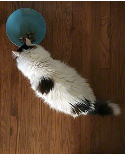
Snack time. I love Spencer's spots.

We brought Spencer home to recover. He was really hungry and it was comforting to see him chow down. He bounced back from the sedation very well, but meanwhile I was left to wonder where the update was and why I wasn't getting any news.