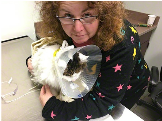
The power of the Lil' Bub sweater is strong. Good Job, Bub!

That said, it kinda IS a miracle because if a cat is going to get cancer, then small-cell lymphoma is the one to get. It's treatable for a good long time. It grows slowly. It's not an expensive treatment and Spencer can possibly have a good year or MORE of quality life. That would put him at about 17-18. If it had been carcinoma, we'd be lucky to get 9 months, if that. More likely we'd get about 3 months.