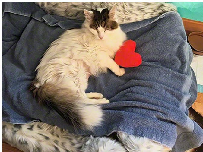
Thank you from Spencer, too.