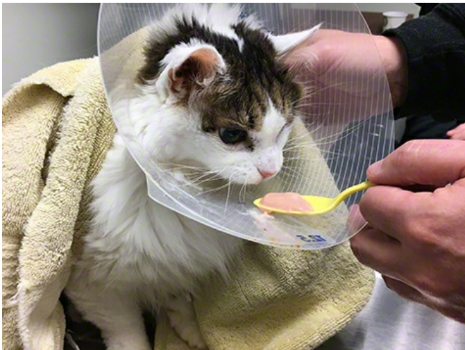
Baby food to the rescue.

The dog got scratched by the skunk but it didn't even need a stitch. They needed to update the dog's rabies shot, but otherwise he didn't need anything other than about 50 baths. The receptionist shooed them out the door saying they should have called first so they could have treated the dog outside the building. As it was the place had no open windows and we were all suffering. The couple went into the vestibule between the two front doors because it began to rain. It only created an inescapable stink-zone that everyone who entered or existed the building was going to have to walk through. I started to wonder if all the bags of chips in the nearby vending machine were going to stink like skunk, too.