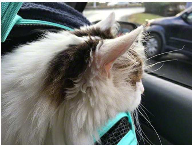
Traffic cop, Spencer.

I gave the vet tech a new ziplock bag with a note on it to please save all of the fur they shaved off of Spencer's belly. I wanted to keep it to make a memorial out of his fur one day. I was embarrassed to ask for such a silly thing when surgery was all I should focus on, but being a realist I also knew I might need that fur sooner than I'd like to admit.