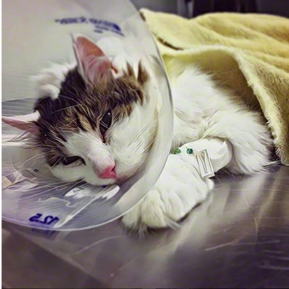
Nothing is a worse indignation than the cone of shame.