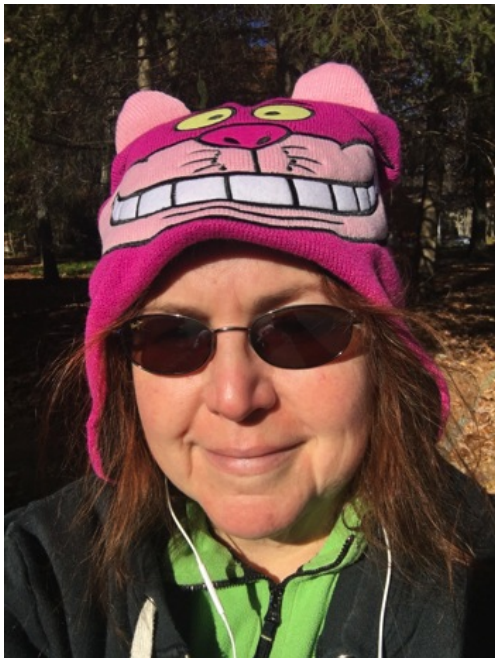
Another day, another walk.

For a long time now I've had this calming feeling as I take my walk around the neighborhood. I'm enchanted by the wind as it scoops up the dried autumn leaves causing them to swirl and dance, and equally charmed by two squirrels who playfully chase each other across a well manicured lawn. I hear birds chirp merrily along as I see their silhouettes on a sun-kissed branch. It reminds me that I'm part of all these things and we're all part of something much bigger.