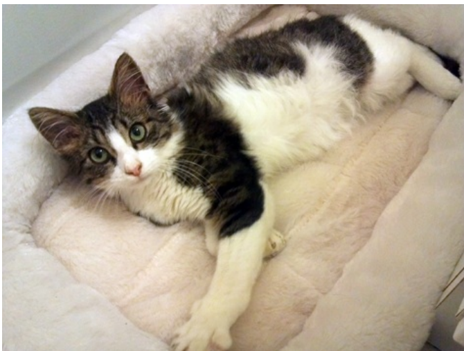
Someday we hope Bongo will be able to run and play like any other kitten.

I realize there are some folks who would just take the leg without getting more definitive answers. It's a lot less expensive to take a leg off than it is to repair it. The recovery time is less and there are no chances of having to do a second surgery if the leg is already gone, instead of if the surgery is done badly.