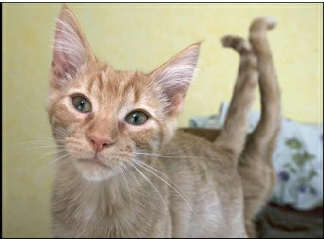
Mikey waiting for his forever home.