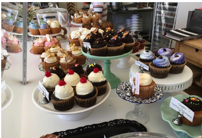
Wildflower Confections.