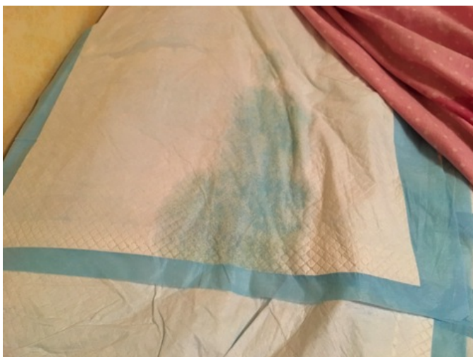
Being prepared made a big difference. There was no way any urine was going to get on the mattress with a shower curtain under these puppy pads.