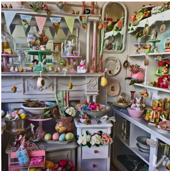
Tickled Pink.

The Kellogg ladies did come visit. I offered to take them over to Wildflour Confections [6] and Tickled Pink , [7] which I consider to be a perfect girlie-afternoon adventure. They were in agreement because really, cupcakes and cute girlie things to buy? What is better?