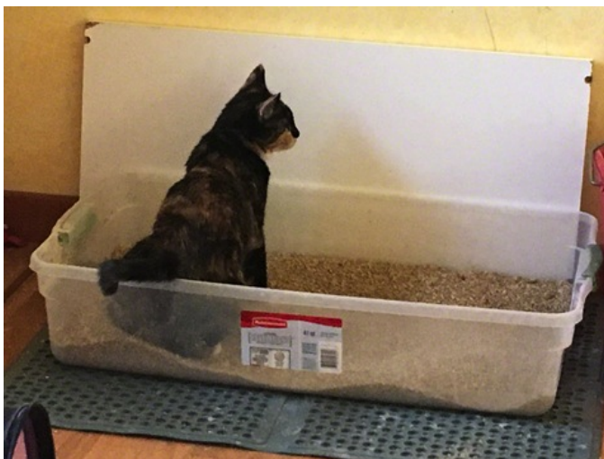
Whew.

I didn't know if she was reacting to a urine smell that I didn't clean well enough or if she was energized by my being there a few times so early in the morning and by just eating. She corrected her behavior immediately once I hissed, but what was the bigger meaning here?