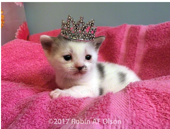
Princess Willoughby.