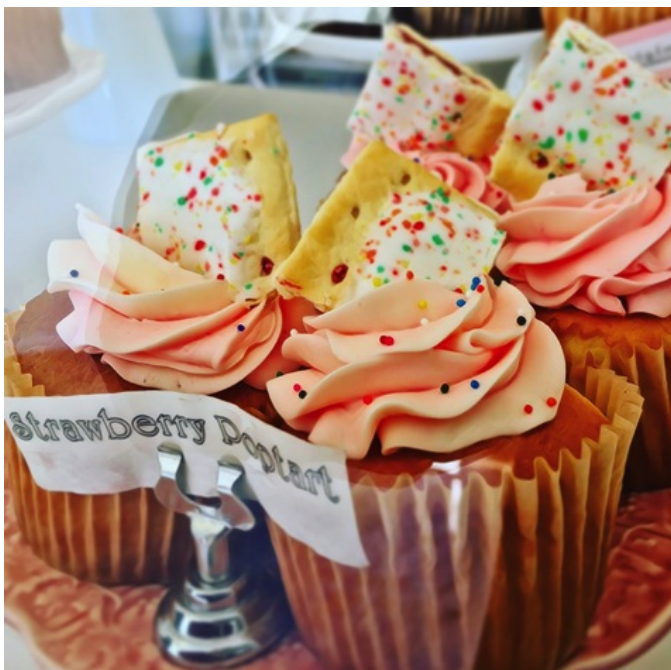
STRAWBERRY. POPTART. CUPCAKES.

We had a very lively conversation during our drive. The girls mostly occupied themselves and, once again, I was impressed by how quiet they were.