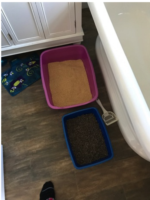
Two litter pans in the master bathroom: one with the litter Holly used at the rescue and one with World's Best. (3)