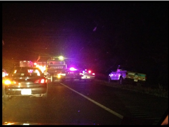
It took 6 hours to get home due to accidents and road construction. We arrived at 1AM, but it was worth the long drive to make certain King was settled in his new home.