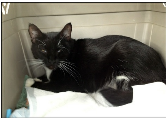
Wishing he was anywhere but inside a car...