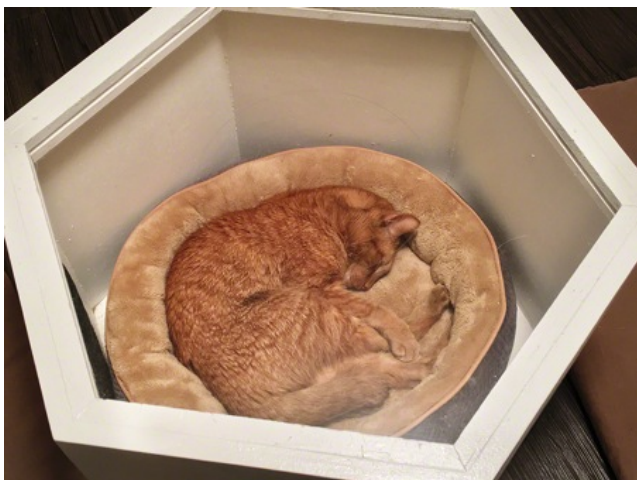
Nicky napping.

MEOU Parlour partners with KittyKind [6] a terrific New York City based cat rescue. Their collaboration has helped find homes for over 100 cats to date.