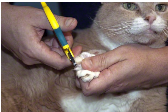
Nicky getting a claw trim.

Now, does this product calm a cat who hates getting their claws trimmed? No, but I believe that between the quiet operation and what it does for the cat-parent's confidence might also make those tough-to-trim cat claws a thing of the past if you take it very slowly and only aim to trim a claw or two at a time.