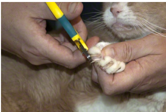
Nicky.

Since I promised to give it a try, I decided to test our foster cat, Woody. He was sitting on my lap, relaxed. I gently held his paw. All I had to do was line up the conical hole between the blades with a claw. I read on the package that you have to be careful the first few times you use it to make sure the claws don't go too far into the opening. If they do go too far it means you need to exchange your Zen Clipper for a smaller size (Zen Clipper will exchange your clipper with no charge to you if you bring it back to the store where you originally purchased it). The claw easily slipped into the hole, not too far. I pressed the Zen Clipper closed and released. It made NO SOUND. Woody didn't seem to even FEEL IT. His claw didn't get crushed as it does with some types of trimmers. It was neatly trimmed back.