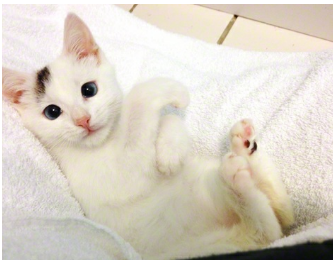
Yes, Freya also sports black and pink "jellybeans."

With surgery day approaching we REALLY lucked out - knock wood -Freya cleared her virus in a day. I can't let her near my cats any longer. If she does well and the surgery is a success, then if she's up to it maybe we can get back to being with cats again. I really hate doing this to her. She needs other cats and she already loves chasing Fluff Daddy around the house ( and vice versa ). I have to balance being careful with making sure every day is a happy one for her.