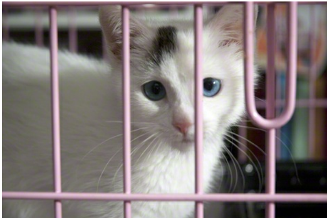
Freya in her pink cage.

Freya's asleep in the little pink cage that sits on the printer stand next to my desk. It's her temporary home during each afternoon so we can be together while I work and so she can enjoy the sunshine that often bathes my office.