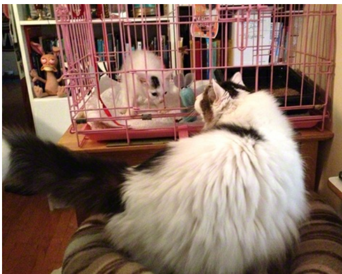
Freya thinks Spencer is her mother.

It's been a long journey of more than 8 weeks since I first offered to foster Freya "just for a few days." Those early days were very hard on me. The amount of care she required basically caused me to shut down Kitten Associates [2] because I could only just do the basics for all our other cats, then grab a nap when there was time. Feedings were every few hours because she was so young and she needed loving care so I had an air mattress in her room and spent many hours just holding her while we both rested in the early hours before dawn.