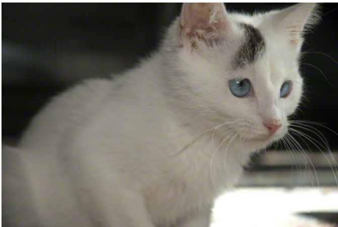
Her eyes are so radiant, it's tough to capture their true color.

I love all my foster cats and kittens as my own, but after the past few months of cats dying and emergency vet runs we need a WIN. I love the heck out of this kitten. We need good news. We need a happy conclusion for Freya. Her light is SO bright. She's SO vivacious. I can't think that this could be the last week of her life, but there are odds that it could be or that the second or third surgery she may need will end her life. It's going to be a long road.