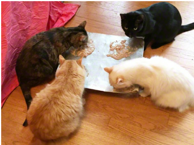
Last breakfast.

As I lowered the tray, covered with small mounds of chicken, they gathered in a circle, joined by shy-Lolli, and began to eat. It was just another breakfast, about their 485th, with me, but this one was different. It was their last breakfast together.