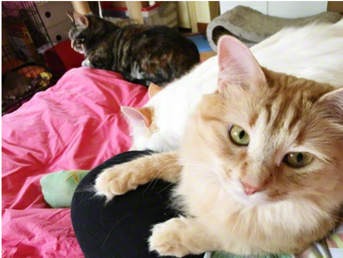
No vacancy.

After over a year I wondered if I was doing the wrong thing. Maybe I should let the girls go to a home on their own? Maybe I was stupid and greedy. I didn't want them to leave. I liked having them here.