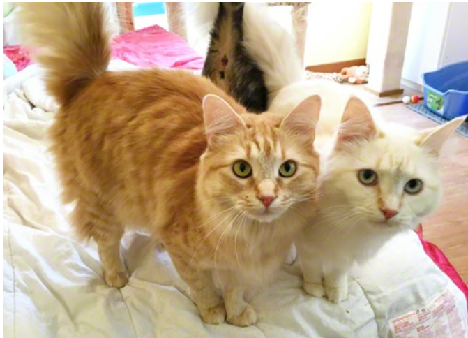
Winnie, Piglet and photobomb by Laney.

I entered the foster room and was met by Laney, Winnie and Piglet. Their tails held high, their eyes bright with excitement. They crowded in close, rubbing up against my legs as I struggled to enter the room without dropping their food. It was time to have breakfast and they were eager to eat.