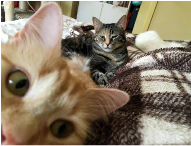
The ever-silly, Winnie.

When I found an adopter, she was flakey, changing her mind over and over again. I wanted to give her the benefit of the doubt so I moved forward with the adoption. I wasn't surprised when after barely a week, the girls adoption fell through, leaving me to drive to Boston and back in an afternoon to bring them back home.