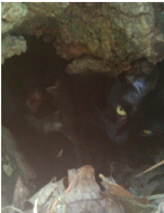
If you look closely, to the left are two kittens.