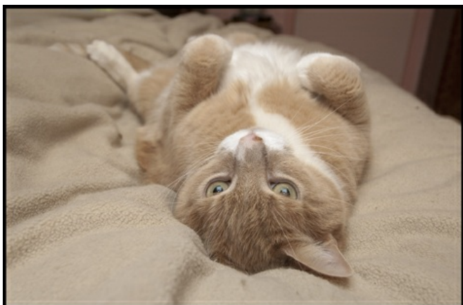
Nicky's view of the world is often upside down.

For the handful of you who've met Nicky, you know he's our BIG 20 pound boy who would rather lay in your arms, belly up, like a baby or get tummy rubs than do just about anything else at all. Nicky is a big sweetheart who LOVES everyone. He and his sister...and then I thought about Nora...are inseparable. She wouldn't survive without her big brother. Oh my GOD..what is happening to my cats?! We found this out just because Nicky was drinking too much water and peeing outside the litter pan. That was all we had for symptoms.