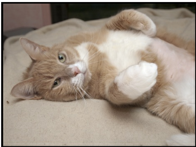
He always gives us "love-dovey" looks.