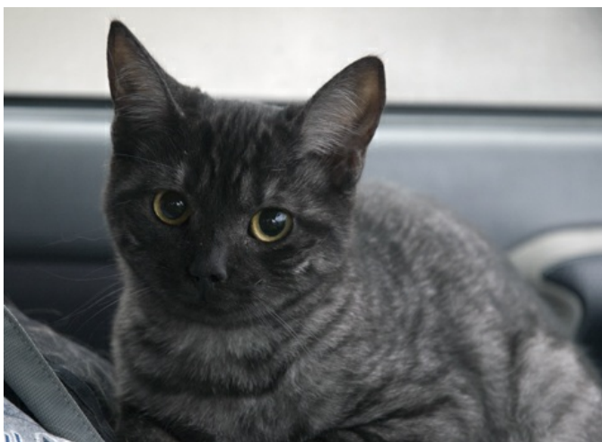
Noelle was a bit nervous but didn't mind being held at all.

The next thing I saw shocked me. Amelia was eating. Noelle was at the back of the carrier, afraid. Then she came over to Amelia. She didn't walk under Amelia, rather Amelia put her front leg over Noelle, as if to protect her. Noelle felt safe enough to eat some food