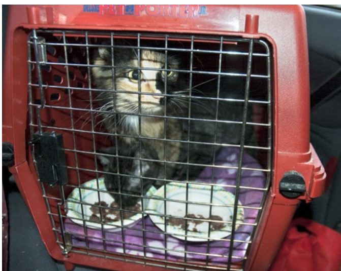
Amelia protects her little ward, Noelle.

The next thing I saw shocked me. Amelia was eating. Noelle was at the back of the carrier, afraid. Then she came over to Amelia. She didn't walk under Amelia, rather Amelia put her front leg over Noelle, as if to protect her. Noelle felt safe enough to eat some food