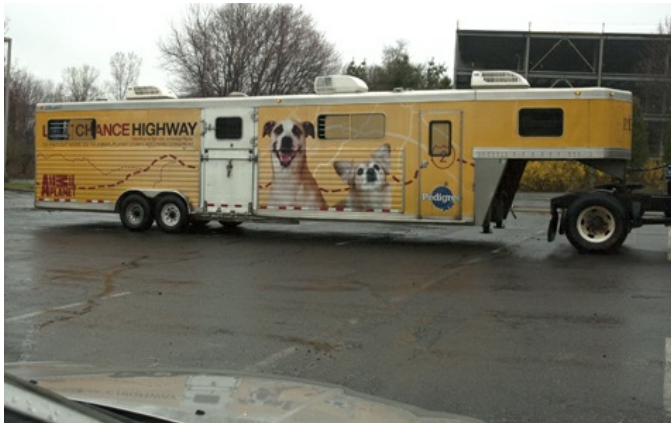
Look familiar? Yep! Transport day is here!