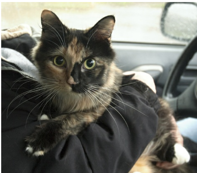
Amelia is a show-stopper, she's so gorgeous.