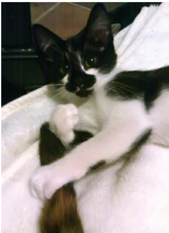
Tail toy.

Now all I have to do is GET THEM HERE and hope they don't break with URIs once they arrive. Okay, I need to get on Petfinder, too and I need to get my web site up for Kitten Associates and I need to get some adoption forms put together. No problem!