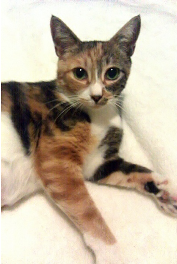
Calico Mama, ID# 6/25-2567