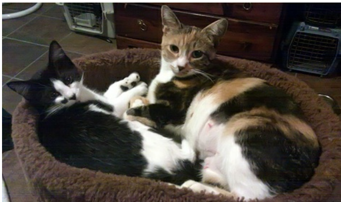
Calico Mama and Pattycake share some mother/daughter time.