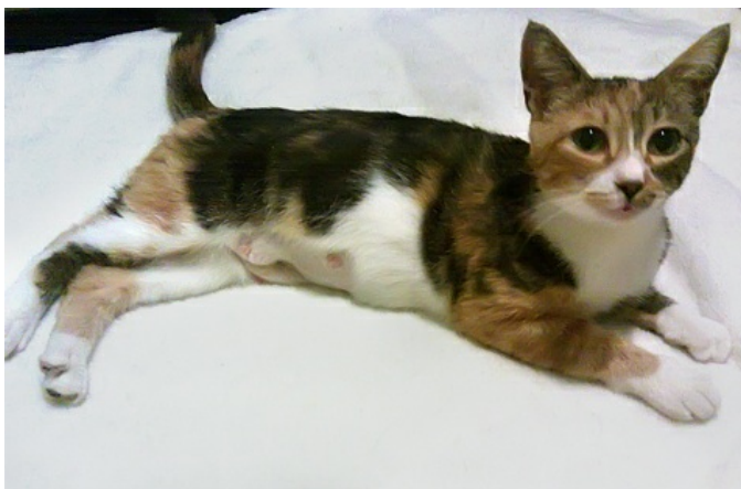
Calico Mama, relaxes before leaving for her new home in South Carolina.

No wonder I'm not getting much sleep and am so tired!