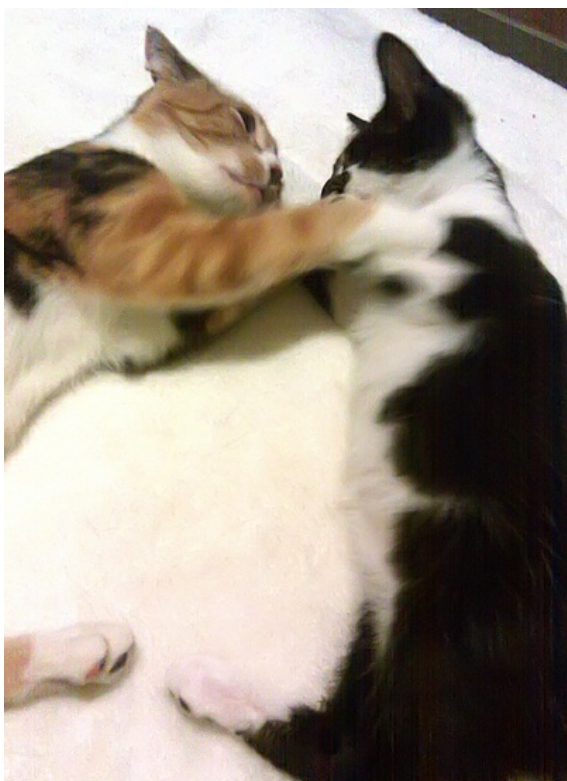
Moonpie wrassles with Mama.

Now that Mama has finished her quarantine period and gotten spayed, it's time for her to go to her new home and meet her new family.