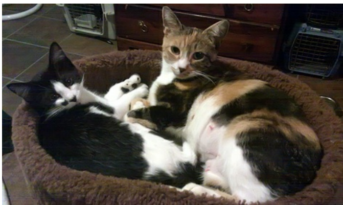
Calico Mama and Pattycake share some mother/daughter time.