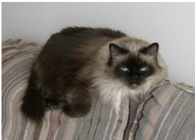
This is Sweetie.

OR an ADOPTER who would LOVE to give these gorgeous girls a loving home.