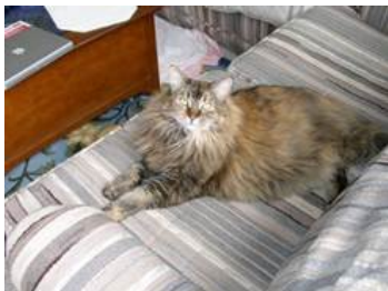
This is Joy's cuteness.

CONTACT ME at info@coveredincathair.com [1] and I'll put you in touch with the owner. PLEASE SHARE THIS POST! I'd love it if we can pull off another miracle and find these girls a safe place to land.