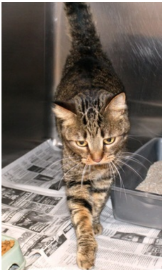
Nice tabby "M" I see! Lovely girl!

PLEASE REFER TO THIS ID# 8/16-3406 when contacting HCC&C.