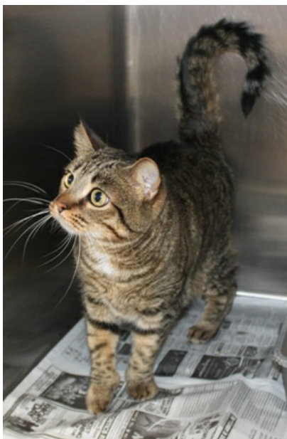
Poor KoKo. Scared and dumped in a cage. She has no idea what she did to deserve this fate.