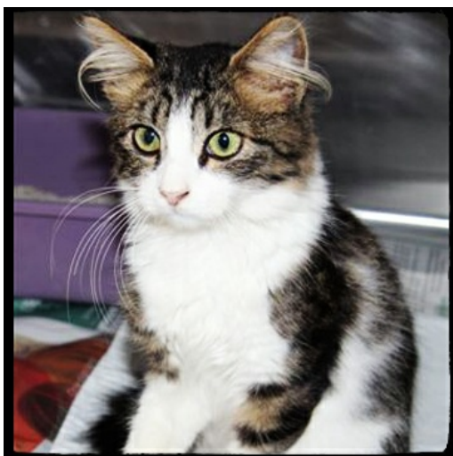
Bongo.

Visit my rescue, Kitten Associates [1] to fill out a Pre-Adoption Application [2] or email us at info@kittenassociates.org [3] to find out more.