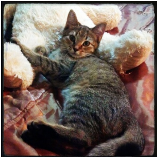
Bunny Boo Boo.