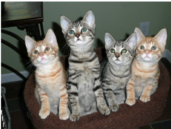
From left to right: How do I know? The orange cats are Skittles and Candy Corn and the silver tabbies are Treat & Treat.