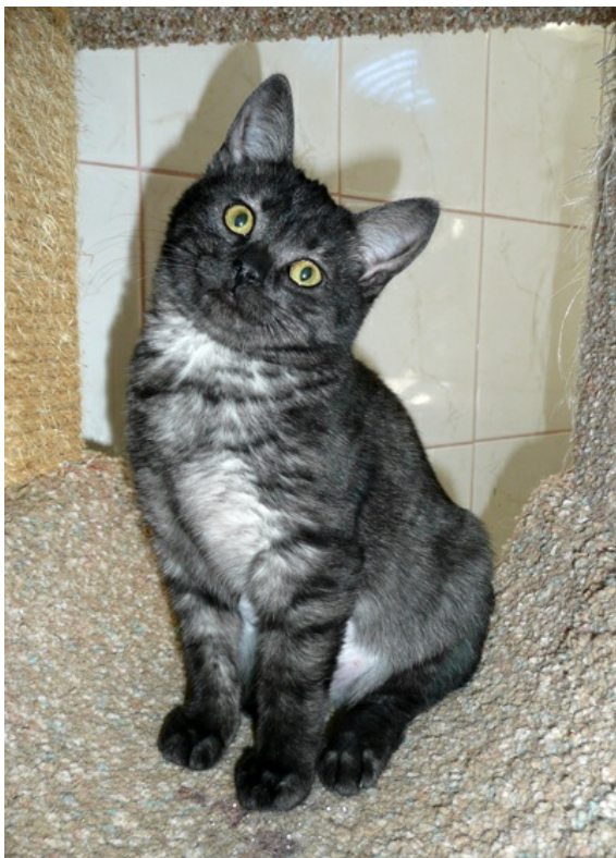
Sweet little Noelle.

A few months ago I said my last "YES" to helping two more kitties: Noelle and Amelia.