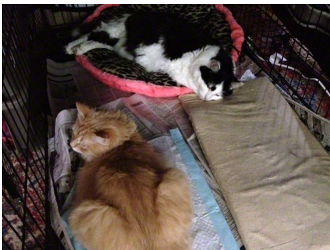
Blitzzen visits DOOD every day.

I function day to day knowing that I'm walking a tightrope. Bills get paid, but there isn't much leftover. If something bad happened to any of the cats or my car, my house, etc., it could just toss me over an edge I can't recover from. My rational mind says things have been tough for a long time, but I'll find a way. My fearful mind pushes me to flip out over not being able to open a bottle or that I can't nicely encourage Spencer to get out of my office so I can shut the door-so the cats won't go in there and pee while I'm sleeping upstairs. I have to yell at him to get him out of the room. This is not me, I love Spencer. I don't want to yell at him, but after years on end of stress, of cats peeing all over, of Jackson and his issues and now he's been attacking my own cats...the vice grip on my poor head gets tighter and tighter. The headaches are worse and worse and I can't find an escape from all of this. There is too much to do, to tend to, other people to help, cats in need.