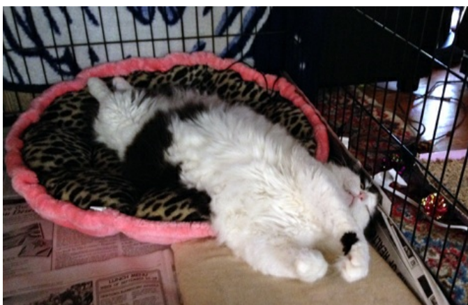
Sweet Dreams.