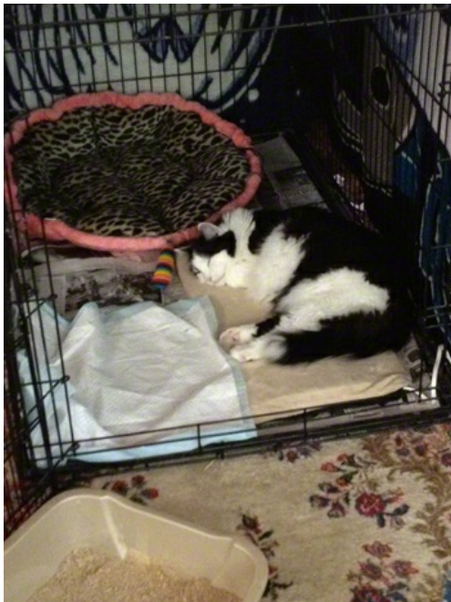
the DOOD's temporary home-featuring a heated bed.

DOOD's been under strict cage rest since Thursday. He's also been on an opiate-based painkiller called Buprenex. It makes DOOD loopy and very friendly. It keeps him quiet, though I'm not sure he's getting very good rest. DOOD also gets a baby aspirin, which is normally a big no-no, but he's only had it a few times.