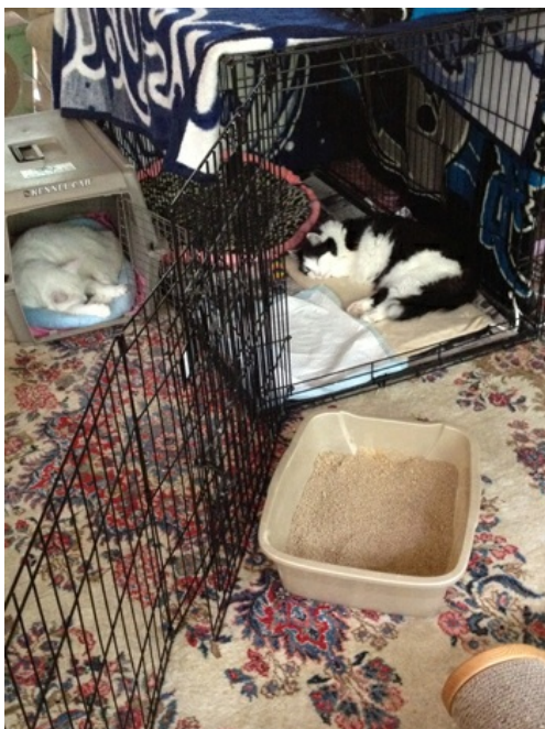
Jackson often sleeps in the cat carrier next to DOODs crate-which is odd since DOOD often hisses at Jax.

Of course, being rational is never easy when you add stress and fear to the mix so last night I had an impressive melt down.