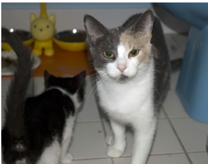
" Last Chance [4] "-Angel with her son, Spyder.

Maybe someday, not in my lifetime, but someday, we won't have cat overpopulation and allowing cats to have kittens will be thoughtfully controlled. Until then, we need to truly revere Motherhood and respect it and respect the fact that some times NOT being a Mother is the smartest and most appropriate thing we can do.