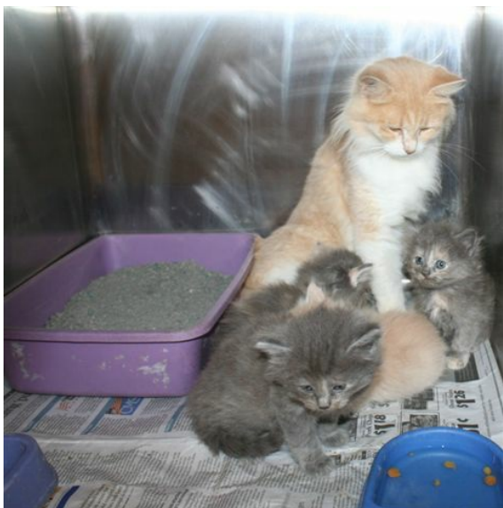
Cupid with "Santa's Team [2]." Cupid, the creamsicle-colored mama, gained 5 pounds after rescue. She almost died she was so thin from nursing her kittens. She is adopted and with a family who loves her dearly. Her best buddy is her Nanny, yes she has a Nanny and she's pals with the family dog. If you look closely, the creamy fur-blob at her feet, is my boy, Blitzten.

There's no bouquet of flowers or box of mouse-shaped treats for a mama cat within the concrete walls of animal control and the people that work there have their hands tied. I KNOW they want those cats (and dogs) out, but the numbers are rising so fast—especially this time of year, how can they keep up? Where's the town budget to add a quarantine room for newborns? Who would happily see their Property Tax go up to make this happen? Where are the guards at the doors that tell people with pregnant cats they shouldn't even step foot inside a shelter!