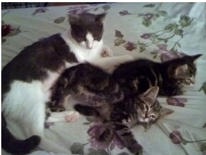
"Huggy Mama" [5], Dash & Snuggles. All got adopted TOGETHER! Yes, all three!

Where we're overjoyed if a woman is "expecting," but if a cat, or dog becomes pregnant, odds are, if those animals aren't in a safe and loving home that will care for them, they'll be given up to a shelter and soon, we'll kill them.