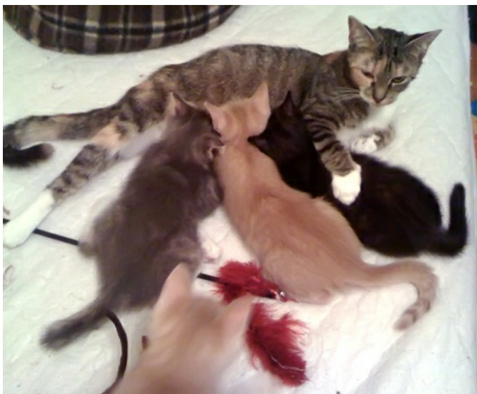
CallaLily and her babies. Callie is doing great in her new home.

I can tell you. They are not going anywhere. They won't even live to see Mother's Day.