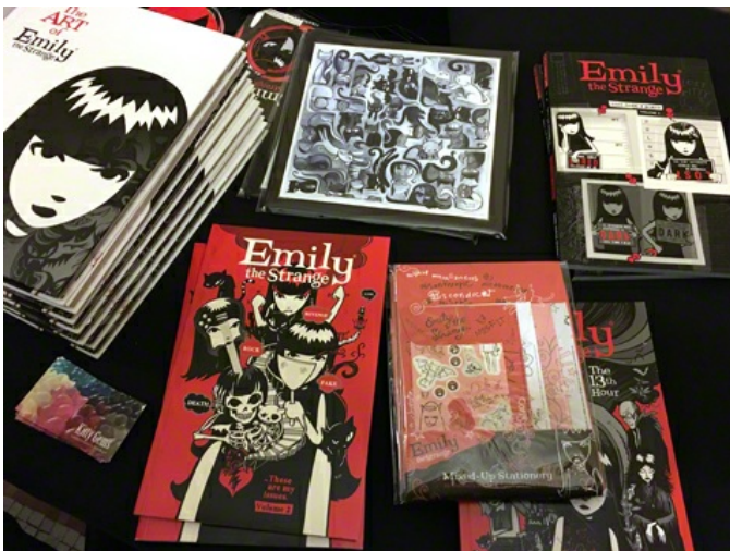
Emily the Strange goodies.