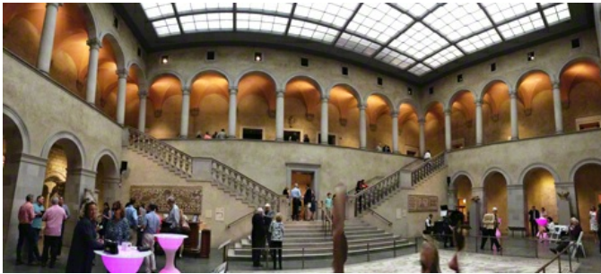
WAM interior courtyard. where we got chastised for almost leaning on the walls (the docent said "everything here is art!").

It was the place to fly your furry feline flag meanwhile celebrating artwork from modern day submissions by the community, to an Albrecht Dürer [2] woodcut from the 15th century. There were also varying cat-centric pieces of art peppered throughout the museum in addition to two special installations featuring a wide range of artistic styles.