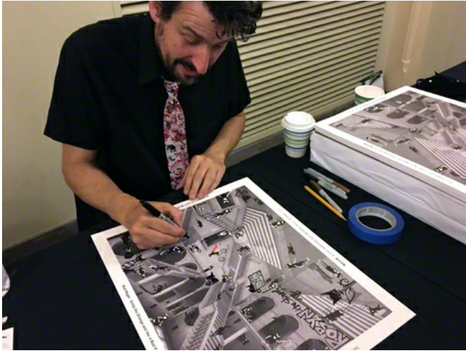
Rob Reger signing my poster.