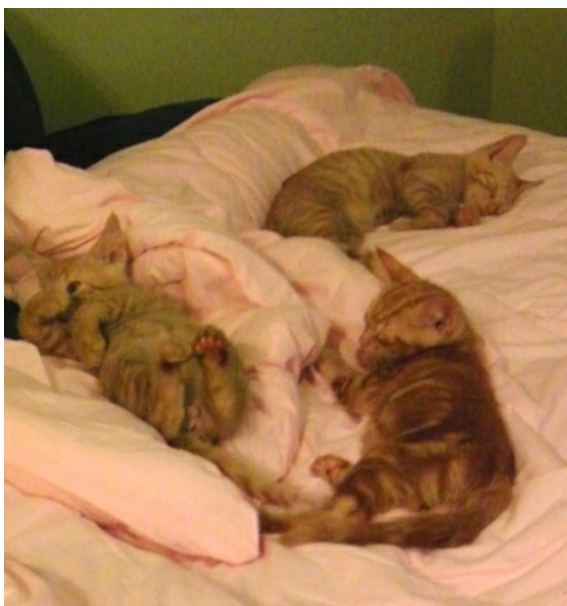
They boys did well after being neutered and it's clear they LOVE sleeping on a BED..

Adoption applications are coming in and this time of year there's a blip up in adoptions. The Pumpkin Patch has a reservation on a transport for next week and I have an Adoption Event for the day they arrive. I hope they can make it up here in time, but I may have to hold off on moving them if we can't raise the funds.