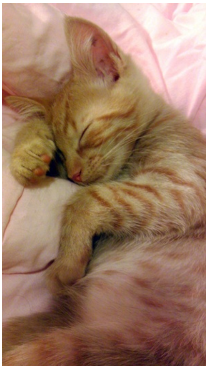
Mikey is too tired to be photographed.

A week has passed and Bobette is feeling better. She's still a bit testy with the kittens, but that's to be expected. They boys are oblivious and spend their days playing, napping and growing. They're ready for their next adventure-Christmas in Connecticut-and with any luck, a forever Home for the Holidays.