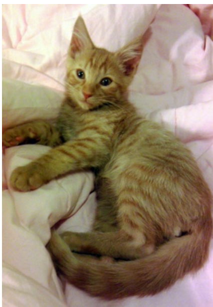
Mikey's stripes are getting more defined.

A week has passed and Bobette is feeling better. She's still a bit testy with the kittens, but that's to be expected. They boys are oblivious and spend their days playing, napping and growing. They're ready for their next adventure-Christmas in Connecticut-and with any luck, a forever Home for the Holidays.