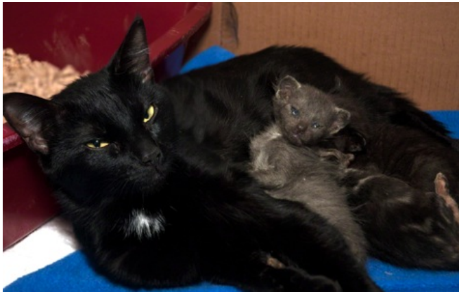
Little Zoe with her Mama and brothers.

I don't know about a lot of things. You see I was just born a few weeks ago. My mom told me we were living in a, well, not-so-nice place before we came here. She said there were a lot of other cats and a lot of other things all over where we used to live. There was so much human stuff she couldn't move around too well, but I guess that was okay.