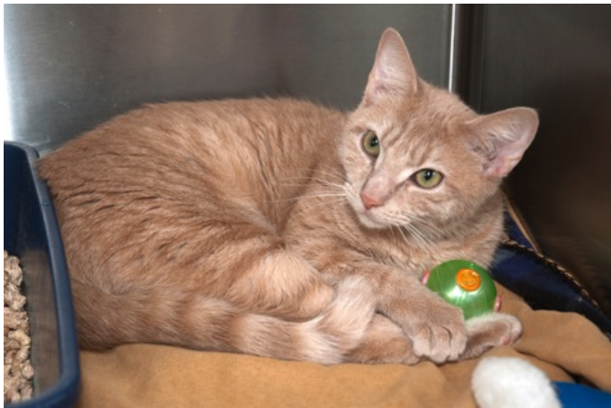
#06, Sweet Peaches, about a year old, who's looking for her forever home or a rescue organization to take her on and help her find one.

She said that she counted how many cats there were and she counted one cat for every one of her toes, then she ran out of toes! So she said there were must be more than 18. I guess her sister had a kitten that went right to Heaven and then another sister got really really sick from being full of babies and she almost went to Heaven, too.