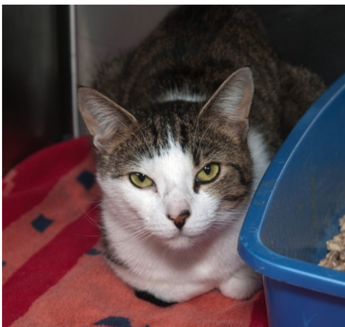
#10 Very friendly female tabby, about a year old.

The problem is there are so many other kitty-cats who came from the not-so-nice-place and they need something called a Rescue Group to help them go to a nice place to live. The kitties don't need much, just somewhere clean and with good food, whatever food is. I only drink milk right now, but I hope you know what I mean.