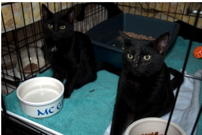
#05 & #09, Silly 7-month old siblings looking for their forever home or a rescue organization to take them on and help them find one.

My brothers are small, but I am the smallest. The ladies said I am...I dunno. Something about bread, being in-bread? They say I should be more developed by now, but geez, I'm doing the best I can.