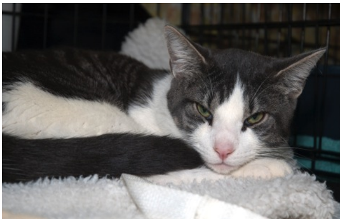
#07, Terrance, about a year old male, who's looking for his forever home or a rescue organization to take him on and help him find one.

lifted us up and put us into a nice clean box with a handle on the top. Inside it there was a soft bed. It was nice and clean, too. They told us not to worry and that they would take care of us. I think one of the ladies had wet sparkles covering her eyes that she had to wipe away with a soft cloth. She seemed sad when she looked at us, but I think that's because I look kinda funny.