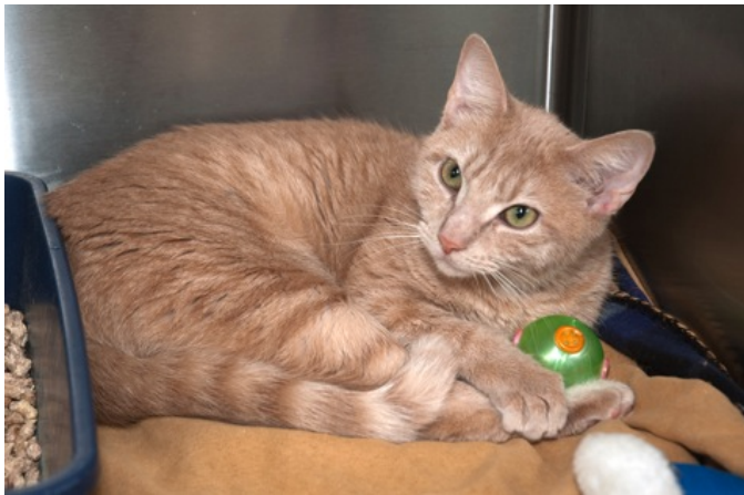
#06, Sweet Peaches, about a year old, who's looking for her forever home or a rescue organization to take her on and help her find one.

She said that she counted how many cats there were and she counted one cat for every one of her toes, then she ran out of toes! So she said there were must be more than 18. I guess her sister had a kitten that went right to Heaven and then another sister got really really sick from being full of babies and she almost went to Heaven, too.