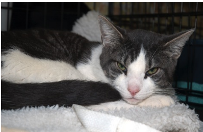
#07, Terrance, about a year old male, who's looking for his forever home or a rescue organization to take him on and help him find one.

lifted us up and put us into a nice clean box with a handle on the top. Inside it there was a soft bed. It was nice and clean, too. They told us not to worry and that they would take care of us. I think one of the ladies had wet sparkles covering her eyes that she had to wipe away with a soft cloth. She seemed sad when she looked at us, but I think that's because I look kinda funny.