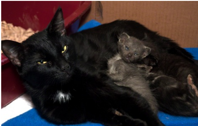
Little Zoe with her Mama and brothers.

I don't know about a lot of things. You see I was just born a few weeks ago. My mom told me we were living in a, well, not-so-nice place before we came here. She said there were a lot of other cats and a lot of other things all over where we used to live. There was so much human stuff she couldn't move around too well, but I guess that was okay.