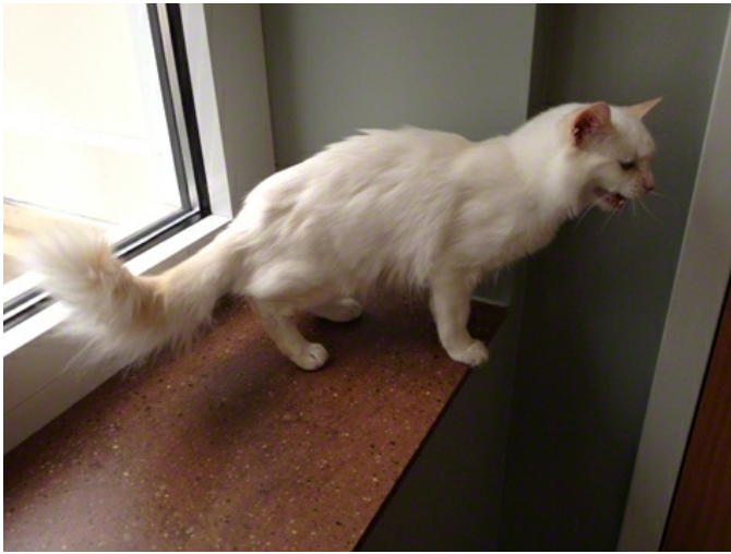
Sneeze-attack.