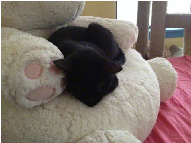
Jelly Belly feeling lousy, too.