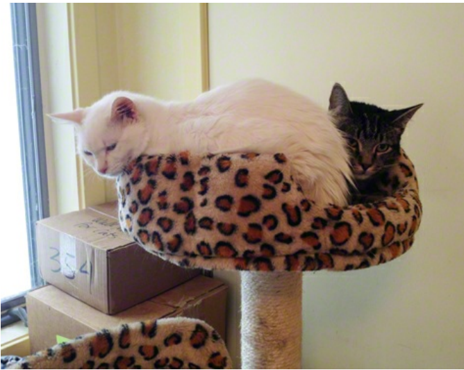
Going down hill fast. Piglet and Lex are both sick.

This could be bad, but what I fear more is what will become of Piglet. She is depressed and not eating that well. Her fever came down last night but I have to check her again today and she gets very agitated if we try to get her temperature. She's so tiny I just don't want to upset her while she's so sick.