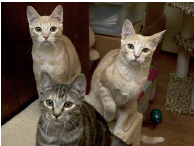
Louie, Larry and Lucy arrive from Georgia.

I had to bring all NINE cats to the Vet to get their CT Health Certificates issued on Monday. The Vet supposedly looked at each cat, but I wasn't privy to seeing the exams as her techs brought the cats into the back of the clinic a few at a time to see the vet. I didn't know if she was checking them well or barely looking at them. I'd given her information that said some of the cats had URIs and she was to check the cats for signs of it.