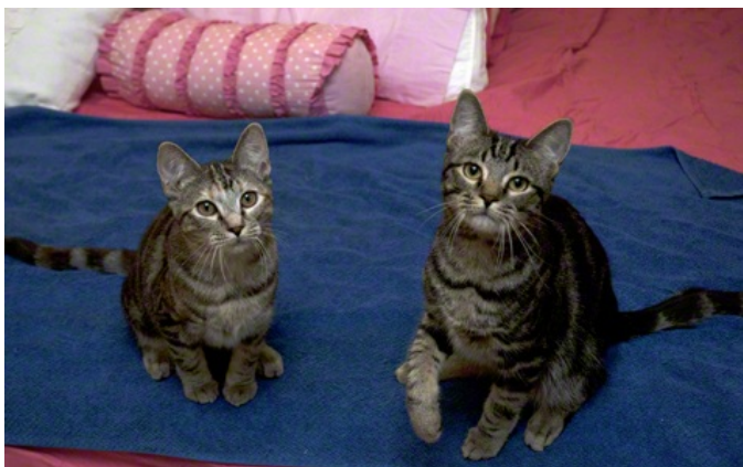
Lucy and Lex (right) before the virus hit.

After waiting for about 90 minutes the vet finally came into the exam room. She talked about Piglet's ear having an infection inside it. She mentioned Jelly Belly has a stage two heart murmur. She did not mention one thing about the URI only what to do to treat Piglet's ear.