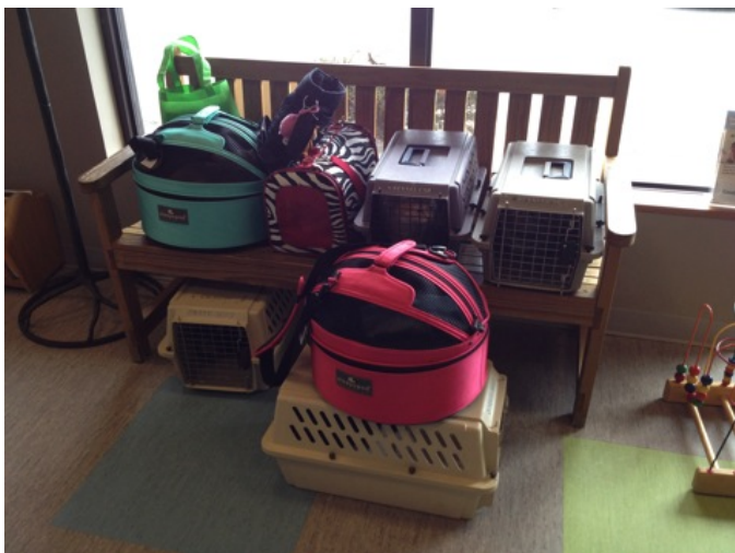
All 9 cats to the vet at once-a record number for me.

I had to bring all NINE cats to the Vet to get their CT Health Certificates issued on Monday. The Vet supposedly looked at each cat, but I wasn't privy to seeing the exams as her techs brought the cats into the back of the clinic a few at a time to see the vet. I didn't know if she was checking them well or barely looking at them. I'd given her information that said some of the cats had URIs and she was to check the cats for signs of it.