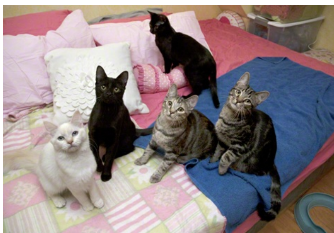
Piglet, Jelly-Belly, Lollipop, Lex and Lucy arrive. So much excitement to finally meet them after all these months.

Laney, Winnie and their 7 kittens arrived. They'd been vetted prior to being transported to Connecticut from their home in Georgia. They were on a transport with other cats who supposedly were also vetted. I will never know for sure the actual cause, but within ONE HOUR of them arriving to my home, a few of the adults began sneezing. At first I thought perhaps the stress of the trip had pushed them over the edge and that maybe in a few days they'd be feeling better. They'd never been sick all the months they'd lived in Georgia.