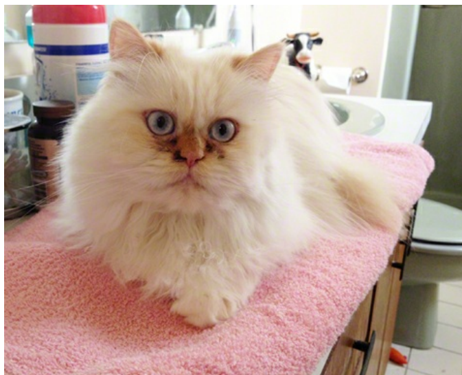
Fluff Daddy, finally on the med but still a bit worse for wear.

Throughout the day I would bring Fluff or DOOD into the bathroom and run the shower. The warm moist air would help their breathing. Fluff particularly enjoyed these sessions and would sit on a thick towel on top of the bathroom counter without fussing around as DOOD often would. I'd sit on the closed toilet and play solitaire on my old iPad. It wasn't much, but it was something I could do to help them recover.