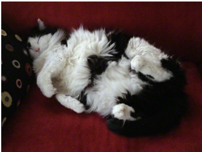
©2015 Robin AF Olson. DOOD sleeping it off, feeling lousy and stuffed up.

All I know is that close to every one of my cats and my foster cats are sick with a viral upper respiratory tract infection and there isn't much I can do about it.