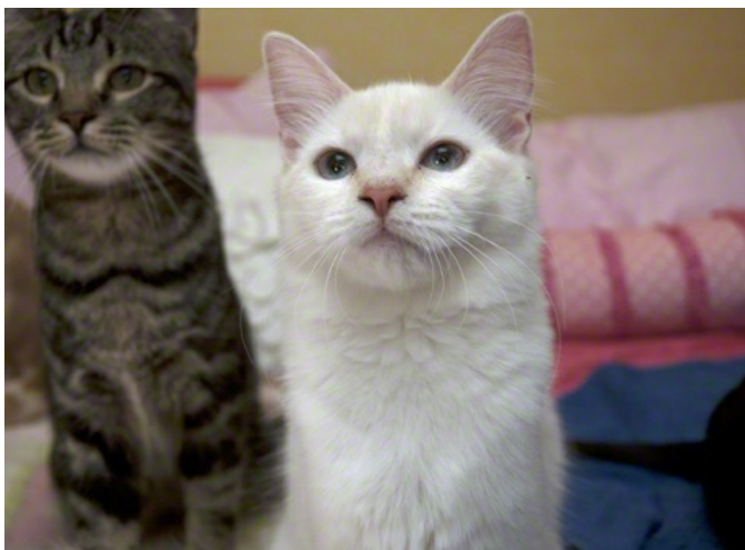
Just before everything turned bad for Piglet.

So I was left feeling like the cats got a lousy exam and I didn't know what to do about the URI. If their lungs sounded clear that was one thing, but if not I'd need to consider antibiotics.