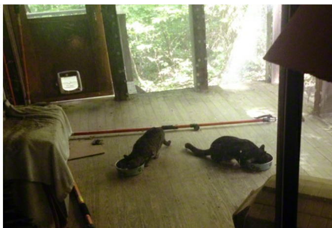
Barry and Bronte have lunch.