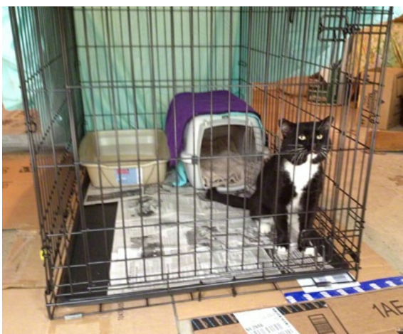
Barry's home for a grueling 6 weeks.

Meanwhile, Barry got neutered. We found out he was about three years old. Thankfully, he hadn't gotten FIV or Feline Leukemia, but I had to believe there were lots of baby Barrys running around the area.