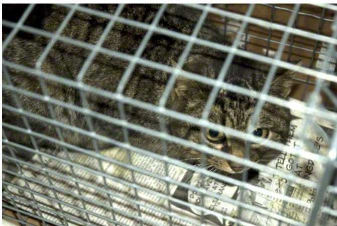
Bronte.