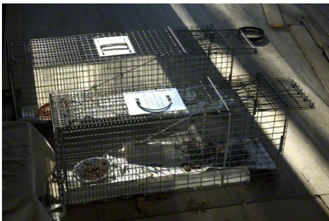
My first attempt at trapping.

Within those areas are so many other facets. Some people prefer to specialize and only take on blind cats or cats with feline leukemia, while others take on the tremendously difficult task of caring for neonatal kittens ( difficult because easily 40% of any litter of kittens can die even if you do feedings every two hours around-the-clock, keep them warm and clean, do everything you're supposed to do..it's not for the faint of heart ).