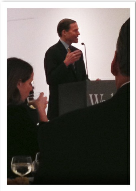
Senator Blumenthal [7] gives his acceptance speech.