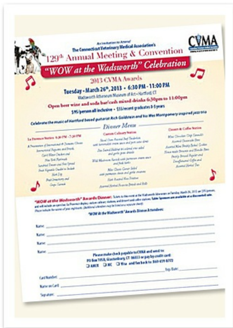
The invitation to the 2013 CVMA Awards.

I've written more about our program (you can see the post HERE [2]).