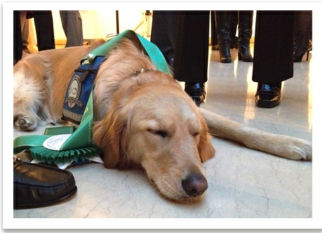
This is Addie the Comfort Dog [6]. She is clearly excited about winning her big green ribbon.