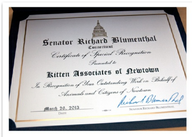
My pride and joy.

I was stunned and thrilled. A certificate from our own Senator meant the world to me. This accolade was from our STATE, where I've lived most of my life. This sort of recognition was something I could have only dreamed of and here it was about to happen.