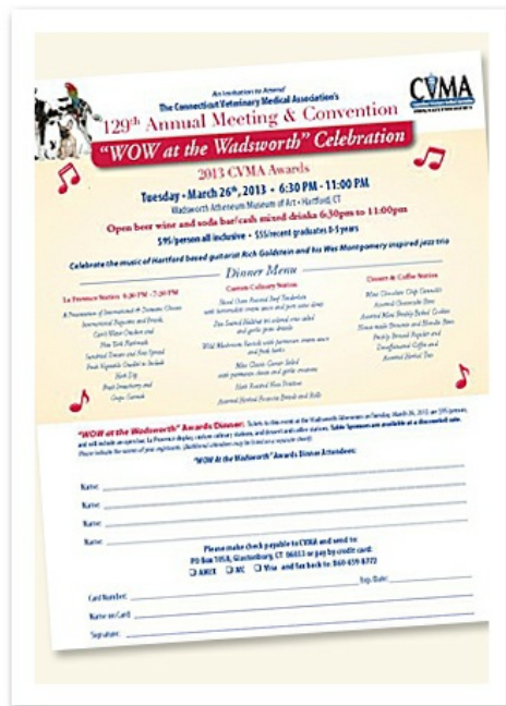
The invitation to the 2013 CVMA Awards.

I've written more about our program (you can see the post HERE [2]).