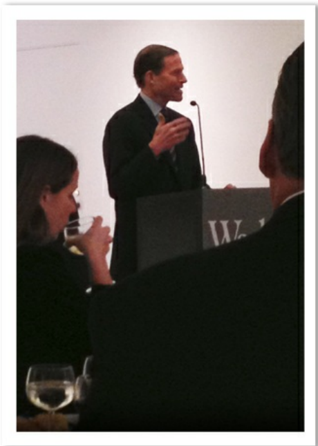
Senator Blumenthal [7] gives his acceptance speech.