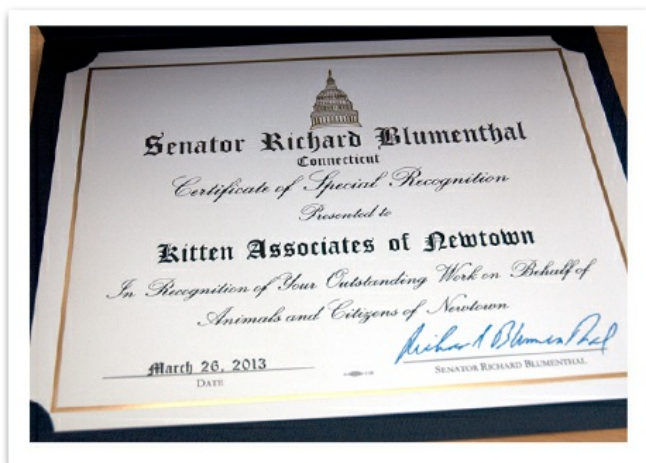
My pride and joy.

I was stunned and thrilled. A certificate from our own Senator meant the world to me. This accolade was from our STATE, where I've lived most of my life. This sort of recognition was something I could have only dreamed of and here it was about to happen.