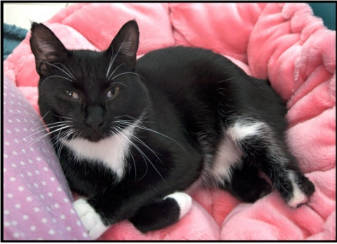
He loves to be loved. King has a heart of gold.

I brought him upstairs to the bathroom which would be his temporary home. He hid and cried.