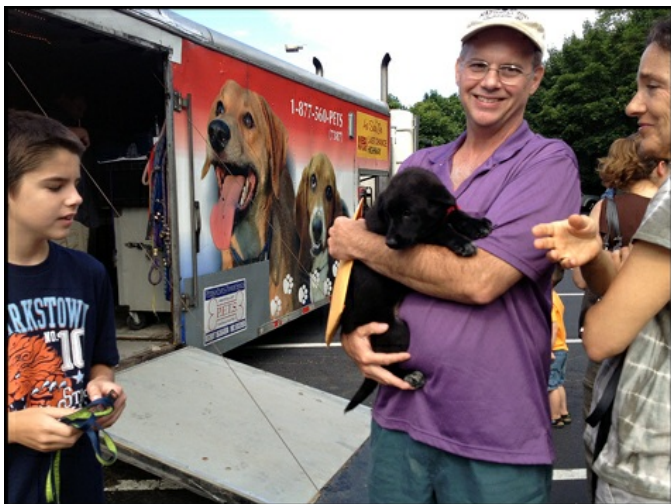
I saw many black dogs come off the transport. Black animals in the south still carry the stigma of being bad luck.

I had lots of questions and concerns. What could I do for him? Would he need surgery? Was he semi-feral? What was I getting myself into? I'd cared for a cat who had a limb amputated but not one without back feet who could not walk on a floor unless it was carpeted.