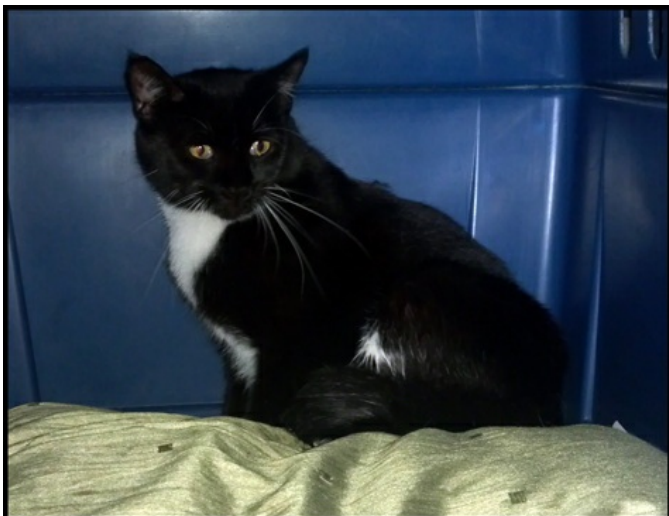
Not so sure about going for a long ride.

King is very special to me, even from afar. Knowing he must have had a difficult life living outside, handicapped by a deformity that robbed him of his hind paws, made me imagine the worst. How he must have suffered trying to get around with two stumps for back legs-especially with trucks, cars and fork lifts buzzing around him. How did he manage? How did he not get run over and killed? How is it that he's so darn friendly? I know the folks at the factory fed him scraps when they could and they put a piece of cardboard down under an outdoor staircase so he's have some sort of shelter, but someone handled this cat. That much is clear.