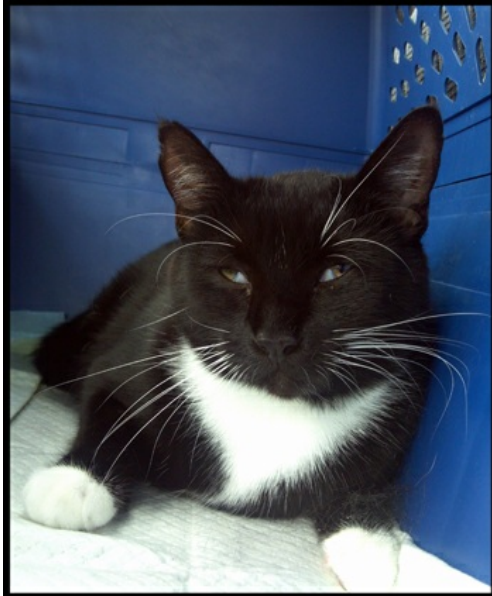
King getting settled prior to transport.

It's hard to believe that we rescued King from a palette factory [1] in Georgia six months ago. In that time, King has been transformed from a thin, filthy rag [2] of a cat into a lovely, chubby cuddlebug.