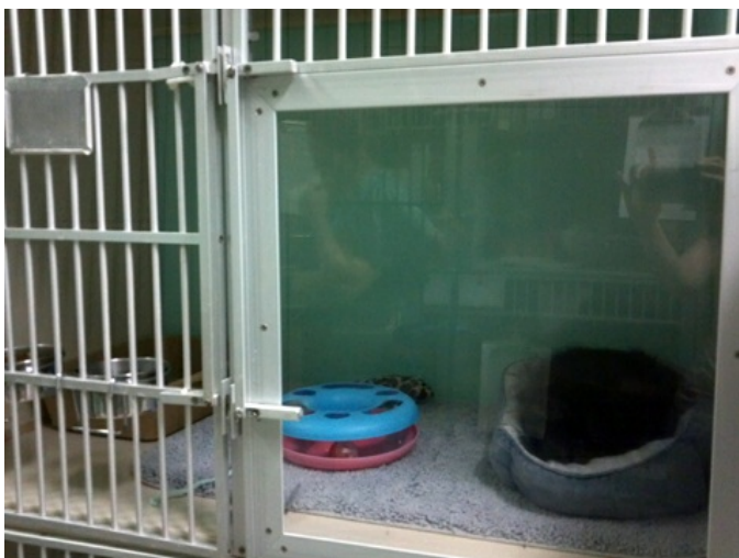
Miss FP in her temporary quarantine space.