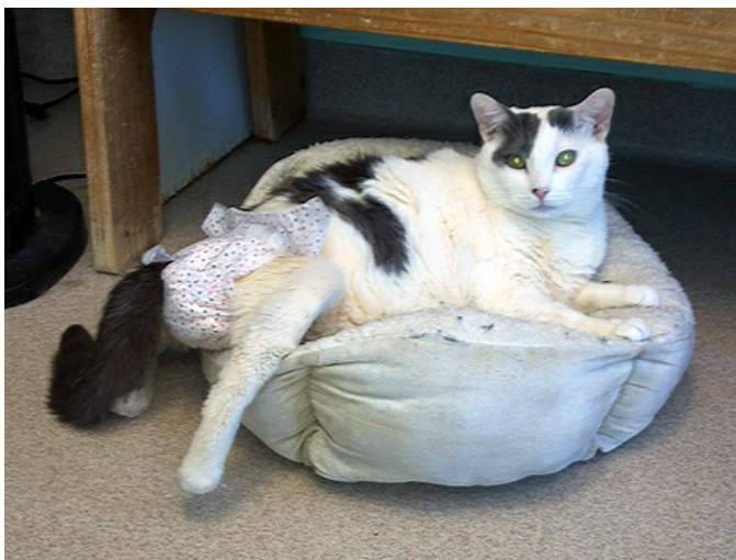
She may have been shot and is now paralyzed, but Tricky doesn't let anything get her down.

Good Mews is NOT that kind of shelter. They did right by Tricky and not only gave her a place to live for the rest of her life if need be, but they help her do her thing, then they give her a bath every day, twice a day. She gets around just fine without her back legs-at least that's what she would tell you.