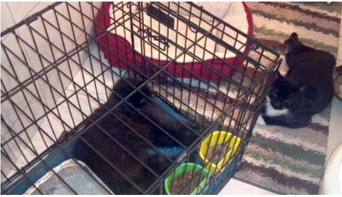
The photo that changed everything for me.