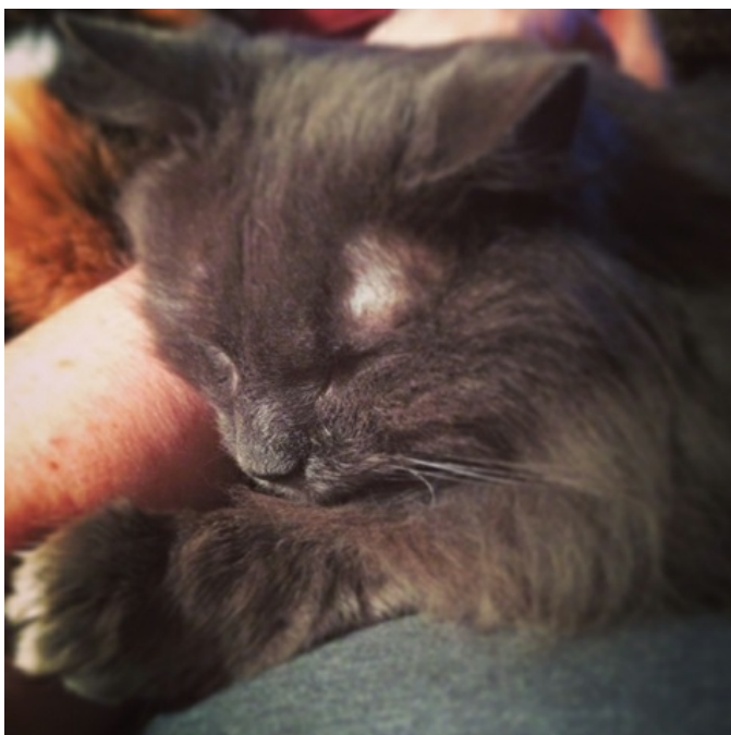
Gracie's final days.

So how do you handle not knowing the best route to take with your pet's care? The answer is that you will never know the best route ( rarely only in hindsight ), BUT, if you come from a place of always trying to DO YOUR BEST for your cat, do research, ask a lot of questions, weigh the pros and cons, no matter how things resolve ( a cure or your cat dies ), then you can sleep at night because you did everything you could.