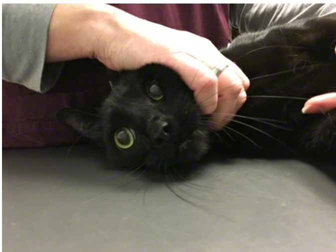
Poor Jelly was scared but he was a really good boy through his exam.