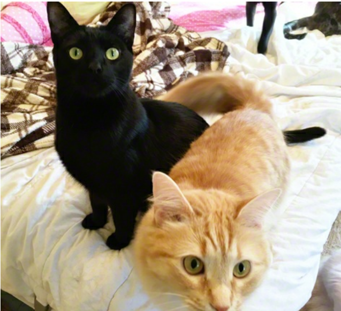
Jelly with Auntie Winnie (who is still hoping to find her forever home!)

We can't wait. We can't afford it with the funds we have on hand, so we have to try to raise the funds for him NOW and we know it's going to be tough.