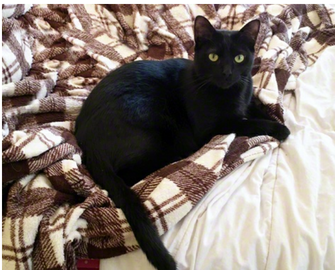
Mr. Handsome-JellyBelly relaxing on his blanket.

The other night Jelly did something very strange. He laid down during play time. I knew something was wrong.