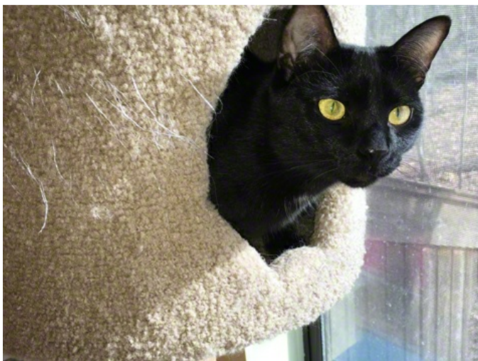
Lolli's hidey place.

Yes, it's my fault. I've decided that after everything they've gone through, Laney, Winnie and Piglet MUST be adopted together. Finding an adopter to take one cat is tough enough, but three? I must be insane. I've also decided that JellyBelly and brother Lollipop have to stay together, too, but Lolli is fearful. Who would want to adopt him? Lolli has never been cuddly and though he will sit next to me and sleep, he's very jumpy. I know that in time he could improve, with the right family who would go slowly with him, but that's a lot to ask.