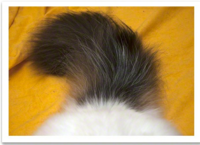
The tail of tails.

We decided to do the treatment for Bartonella, then wait to see if Bongo improved before going to the next step, which would be doing an echocardiogram, the only way to see the thickening in the walls of the heart that is indicative of HCM.