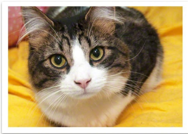
Bongo-loaf.