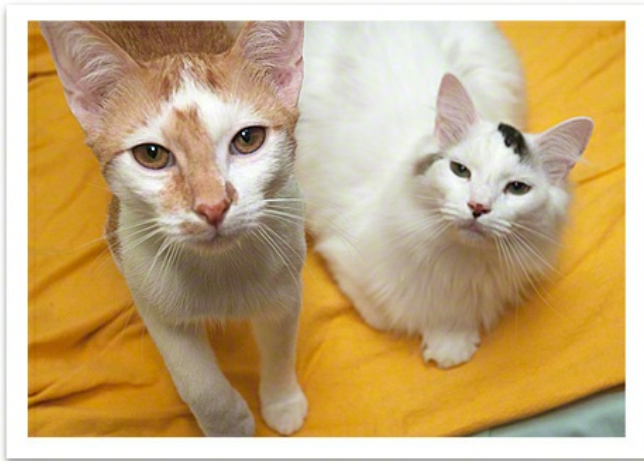
Barney and George.

There were a few bumps in the road, particularly with Bongo. I noticed he'd pant after a short period of playing and at rest his respirations were far faster than the normal, roughly 20-40 per minute. This concerned me greatly because I'd lost a cat to HCM, hypertrophic cardiomyopathy [3] and the only sign I had that something was off was his breathing had a "hitch" to it. By the time I knew he was really ill, it was too late and he passed away during attempts to treat him. Ever since that horror, I've been more vigilant.